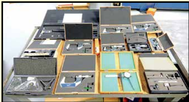
VIEW OF PRECISION INSTRUMENTS