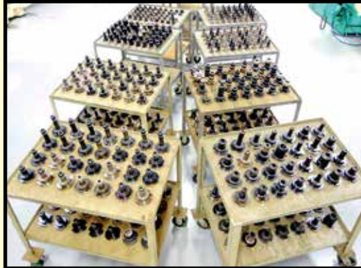
PARTIAL VIEW OF MACHINING CENTER TOOLING