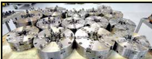
6-JAW ADJUST-TRU CHUCKS

INSPECTION & DEMONSTRATIONS Wednesday November 11 9:00 A.M. to 4:00 P.M. & Morning of Sale