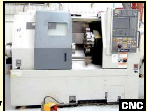
MORI SEIKI SL-253B CNC LATHE

At the Premises of BGS INDUSTRIES 11155 Windfern Rd., HOUSTON, TX 77064 (See Directions on Back Page)