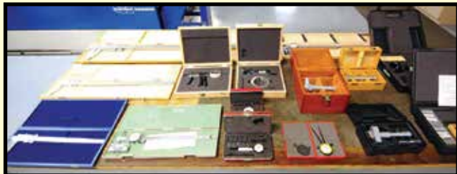
VIEW OF PRECISION INSTRUMENTS