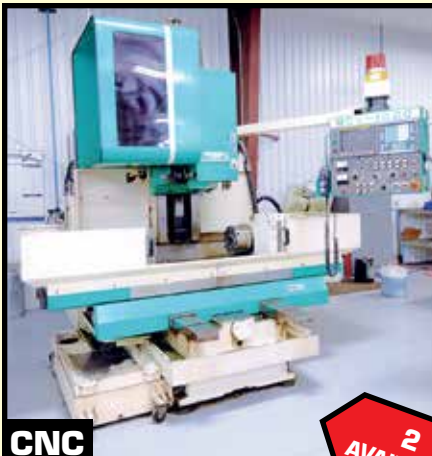
DAH LIH MDL. MCV-1500 4-AXIS VMC