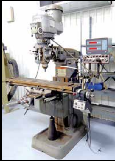
BRIDGEPORT VERTICAL TURRET MILL