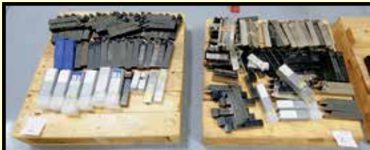
PARTIAL VIEW OF TURNING TOOL HOLDERS

PRECISION MACHINE ACCESSORIES HUNDREDS OF HIGH QUALITY CAT-50 AND CAT-40 TAPER TOOLHOLDERS OF EVERY DESCRIPTION, SPRING COLLETS, CAT-50 RIGHT ANGLE MILLING ATTACH., KURT ANGL-LOK MILLING VISES, (14) 6-JAW ADJUST-TRU SCROLL CHUCKS, CLAMPING KITS, ASSORTED HAND TOOLS MUCH, MUCH MORE! EXPENDABLE TOOLING WIDE ARRAY OF INDEXABLE CARBIDE TURNING TOOLS, BORING BARS, INDEXABLE DRILLS, CUT-OFF AND GROOVING TOOLS, THOUSANDS OF CARBIDE INSERTS, FACE MILLS, SOLID CARBIDE & COATED ENDMILLS, DRILLS OF EVERY DESCRIPTION, REAMERS, SPECIALTY CUTTERS, (THE ABOVE IS NEATLY SORTED IN ROLLER DRAWER TOOL CABINETS, AND WILL BE OFFERED BY THE DRAWER).