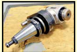
RIGHT-ANGLE MILLING ATTACHMENT