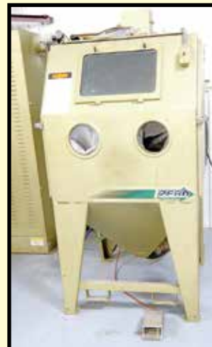
ZERO BLAST CABINET