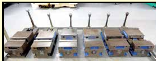
KURT MILLING VISES