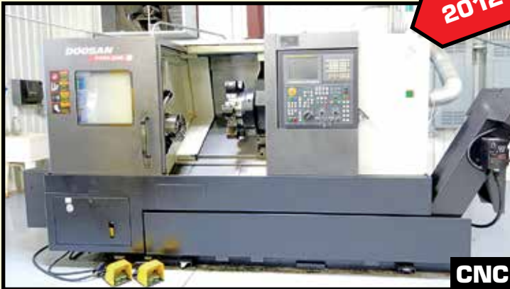
DOOSAN PUMA 2600 CNC LATHE