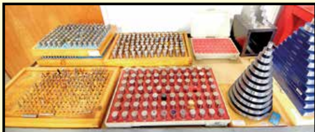
VIEW OF PRECISION INSTRUMENTS

BROWN & SHARPE TESA MICRO-HITE 600 DIGITAL HEIGHT GAUGE, new 2006, S/N 2H0030; RENISHAW MDL. QC20-W BALL BAR SYSTEM; PRECISION GROUND BLOCKS; DIAL-TYPE HT. GAUGES; MITUTOYO GAUGE BLOCKS; HAWKEYE RADIANT BORESCOPE; MITUTOYO DIAL TEST INDICATORS; RING AND PLUG GAUGE SETS; S&T ANALOG MICROMETER BORE GAUGES from 1/2" to 2" cap.; TREMENDOUS ASSORTMENT OF MICROMETERS; MITUTOYO DIAL BORE GAUGE SETS from .7" to 6" cap.; BLADE MICROMETERS; GAUGE BLOCK SETS; VERNIER CALIPERS up to 48"; DIAL TYPE CALIPERS; DIGITAL MICROMETERS up to 3"; DIGITAL DEPTH MICROMETER; MICROMETER STANDARDS; PIN GAUGE SETS.