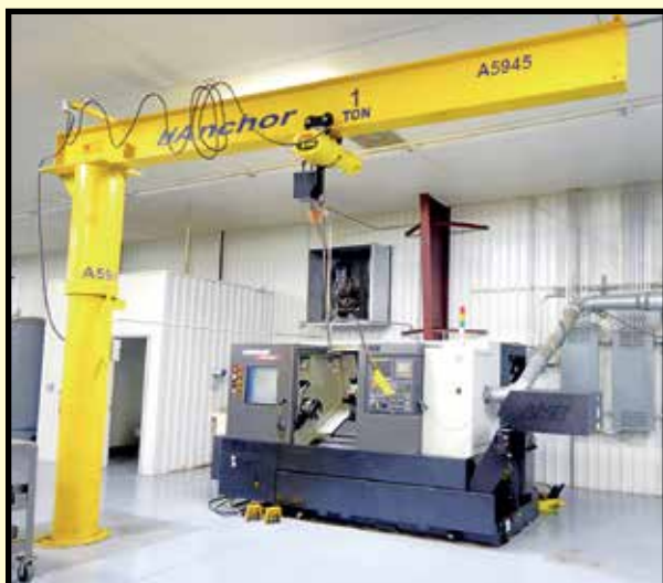
ANCHOR 1 T. JIB CRANE

MANCHESTER TANK 400 GAL. CAP. VERTICAL RECEIVER TANK , new 2011, vert. air receiver.