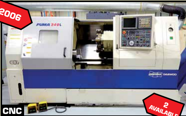
DOOSAN DAEWOO PUMA 240LC CNC LATHE