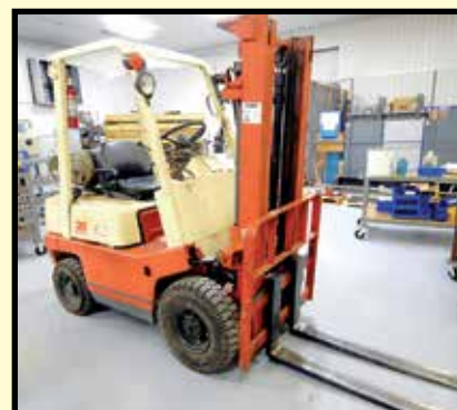
NISSAN 3,300-LB. FORKLIFT