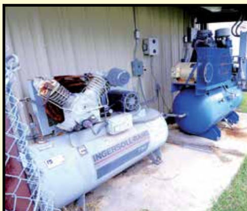
RECIPROCATING AIR COMPRESSORS

BUYER'S PREMIUM: 15% ON-SITE • 18% WEBCAST