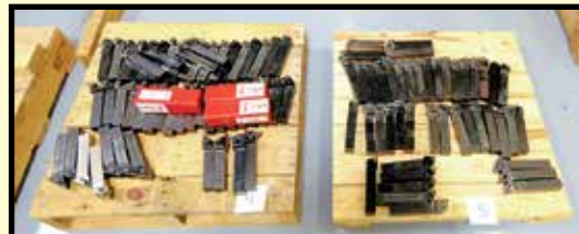
PARTIAL VIEW OF TURNING TOOL HOLDERS

INSPECTION & DEMONSTRATIONS Wednesday November 11 9:00 A.M. to 4:00 P.M. & Morning of Sale