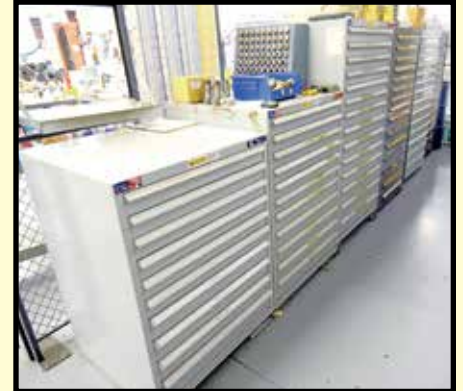
CABINETS FULL OF CUTTING TOOLS

At the Premises of BGS INDUSTRIES 11155 Windfern Road, HOUSTON, TEXAS 77064 (See Directions on Back Page)