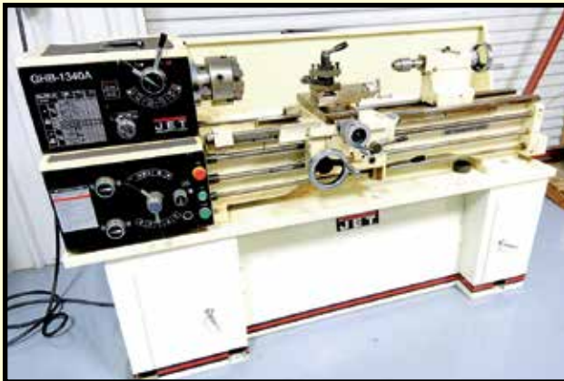
JET 13" X 40" ENGINE LATHE

At the Premises of BGS INDUSTRIES 11155 Windfern Road, HOUSTON, TEXAS 77064 (See Directions on Back Page)