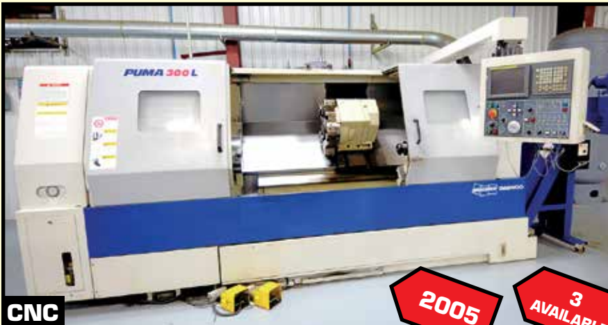
DOOSAN DAEWOO PUMA 300LC CNC LATHE