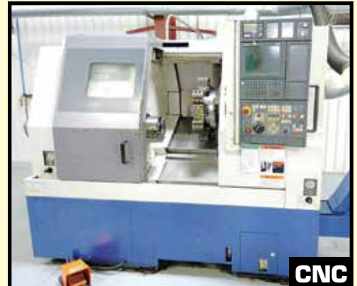
MORI SEIKI SL-203 CNC LATHE