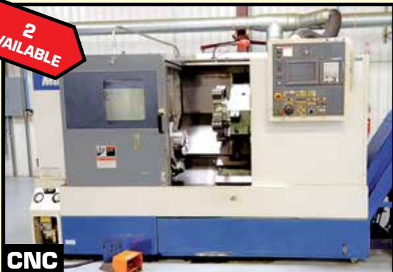
MORI SEIKI FL-2 CNC LATHE