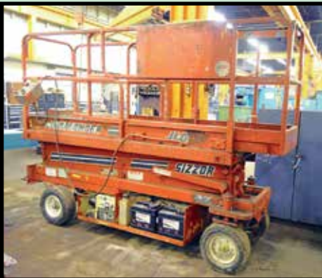
JLG SELF-PROPELLED SCISSOR LIFT

(5) 1/2 T. CAP., assorted reaches, various elec. chain hoists.