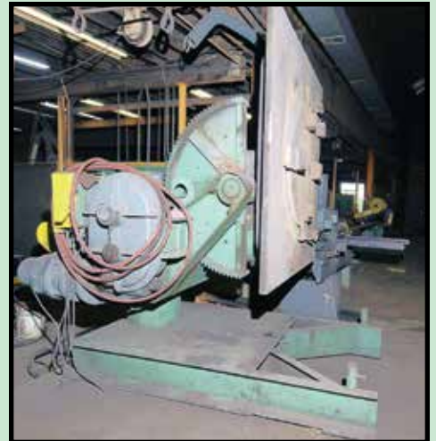
CULLEN FRIESTADT 14,000-LB. CAP. WELDING POSITIONER