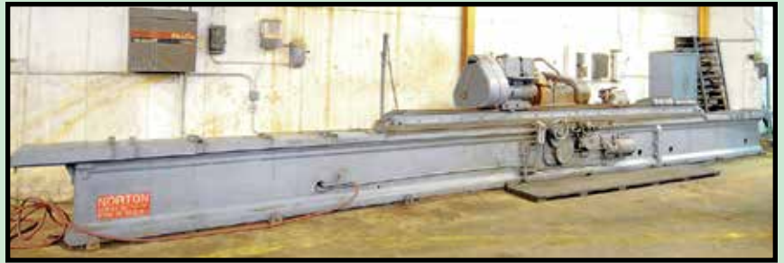
NORTON 14" X 192" PLAIN CYLINDRICAL GRINDER