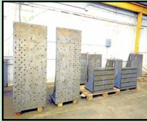
ASSORTED ANGLE PLATES