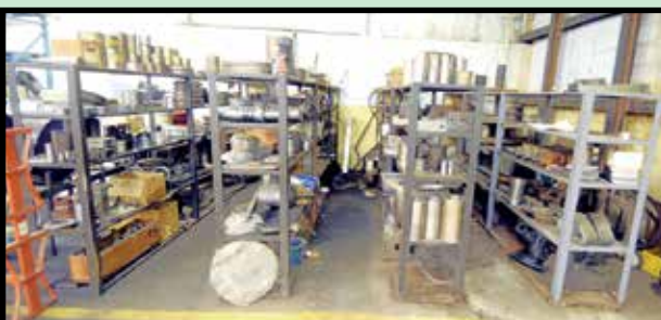
STEEL MILL REPAIR PARTS

EXTENDABLE FORKLIFT BOOM up to 12' reach, unknown cap.; (2) H.D. FORKLIFT BOOMS; STRAPS; NYLON STRAPS; CHAIN LINK METAL STRAPS; H.D. LIFTING CHAINS; WIRE ROPE SLINGS; BAR LIFTERS; PLATE CLAMPS; HYDRAULIC JACKS; SIMPLEX MECHANICAL SCREW JACKS; TIER DROP STYLE PALLET RACK up to 10' beams x 12' ht.