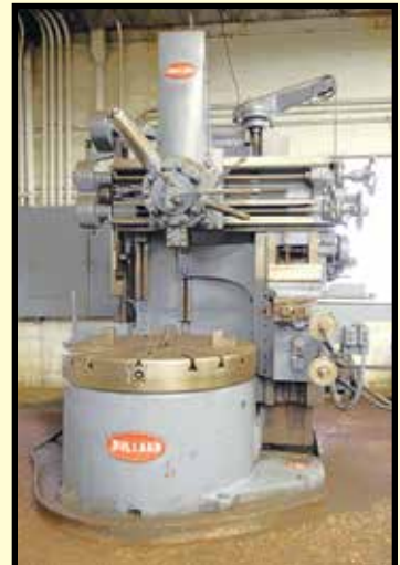
BULLARD 50" VERTICAL TURRET LATHE

Read Partial Terms and Conditions on Back Page of Brochure