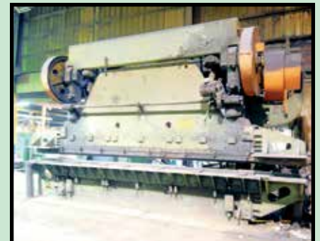
VERSON MDL. 115-12 MECHANICAL PRESS BRAKE