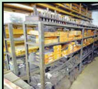
HUGE ASSORTMENT OF BEARINGS