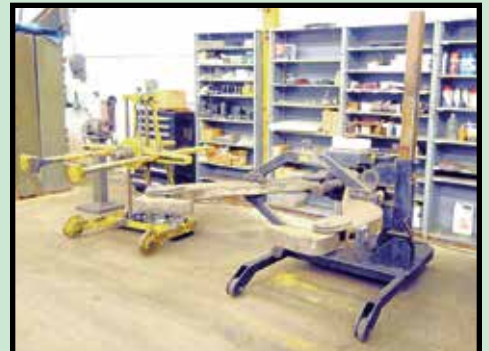
HYDRAULIC GEAR PULLERS