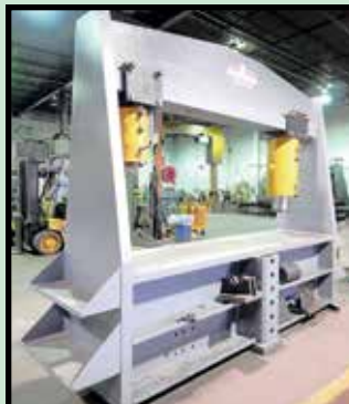
LENHARDT CUSTOM HYDRAULIC STRAIGHTENING PRESS