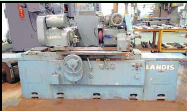
LANDIS MDL. 14X363R UNIVERSAL CYLINDRICAL GRINDER

PRODUCTION MACHINERY CO., 24" max. width, air clutch, pwrdr. rollers, S/N 475-120 (Downtown Location - To be sold by photo. You will get driving directions when you register).