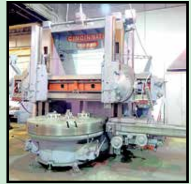
72" CINCINNATI HYPRO VERTICAL BORING MILL