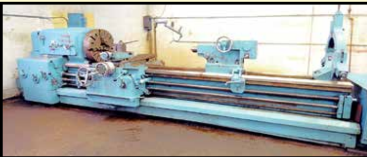
MONARCH MDL. 2516X120 SERIES 80 ENGINE LATHE

Read Partial Terms and Conditions on Back Page of Brochure