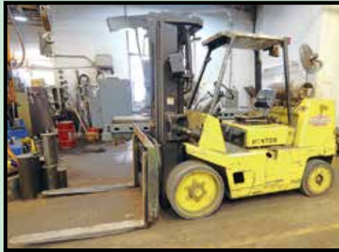
HYSTER LPG FORKLIFT

HYSTER APPROX. 10,000-LB. CAP. , LPG pwr., 2-stage mast, 42" forks, cushion tires, S/N N.A.