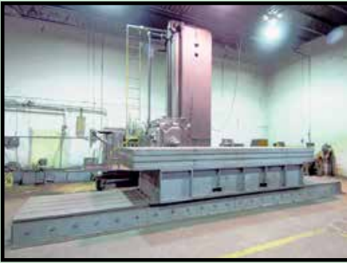
SELLERS 6" FLOOR-TYPE HORIZONTAL BORING MILL