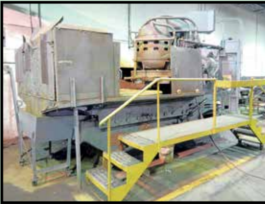
96" BLANCHARD VERTICAL ROTARY SURFACE GRINDER