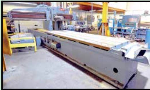
LIBERTY 44" X 144" OPEN-SIDE PLANER