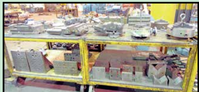
VISES, ANGLE PLATES AND FIXTURES