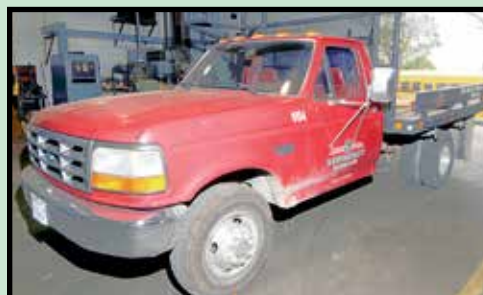
FORD FLATBED PICKUP TRUCK