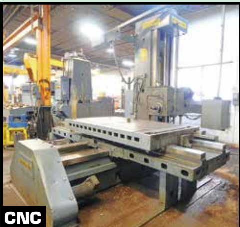
CNC GIDDINGS & LEWIS MDL. 70E4-T-3X CNC TABLE-TYPE HORIZONTAL BORING MILL

BURGMASER MDL. HTC-330 , G.E. Mark Century 1050 CNC control, 39" x 85-3/4" tbl., 3-station ATC, CAT-50 spndl. taper, tbl. outriggers, S/N 246027.