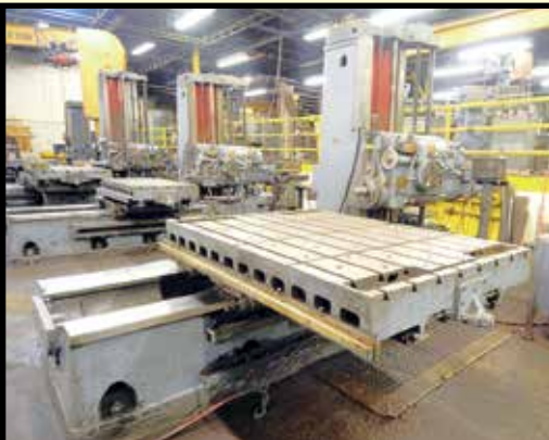
VIEW OF TABLE-TYPE HORIZONTAL BORING MILLS