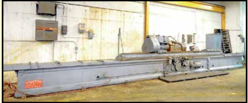
NORTON 14" X 192" PLAIN CYLINDRICAL GRINDER