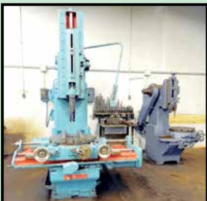
ROCKFORD AND PRATT & WHITNEY VERTICAL SLOTTERS

On-Site Bidding in Alton, Illinois or Bid Via Webcast at BidSpotter.com