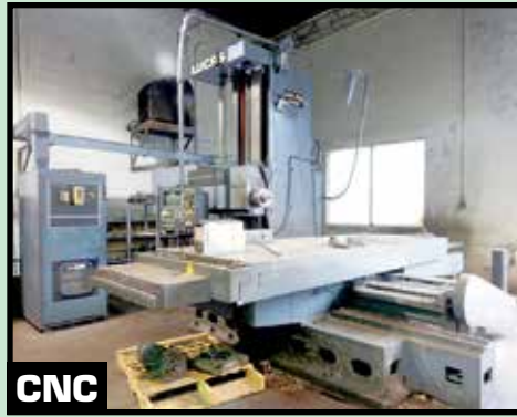
CNC LUCAS MDL. 542B CNC TABLE-TYPE HORIZONTAL BORING MILL