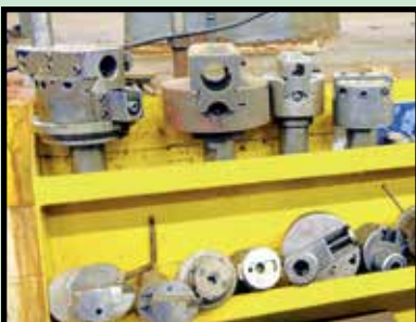
PRECISION BORING HEADS

HUGE ASSORTMENT OF STEEL MILL REPAIR PARTS incl. bushings, bearings, bearing stock, shives, sleeves, shafts, plates, fasteners, lock nuts, 100's of bearings and seals.