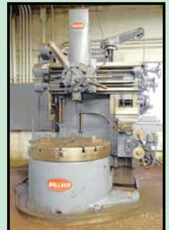
BULLARD 50" VERTICAL TURRET LATHE