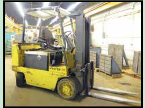
HYSTER ELECTRIC FORKLIFT

NISSAN 7,350-LB. CAP. MDL. ENDURO 80 , LPG pwr., 7,350-lb. cap. @ 24" L.C., side shift, cushion tire, S/N KCUGH02P900670.