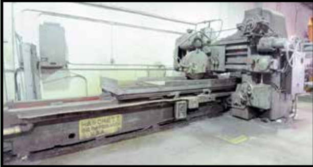
HANCHETT 36" X 84" OPEN-SIDE SURFACE GRINDER