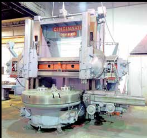
72" CINCINNATI HYPRO VERTICAL BORING MILL

Featuring: Large Capacity CNC & Manual Machine Tools & Grinders; Pressbrakes; Bender; Positioner; Jib Cranes; Forklifts; Rolling Stock; More!