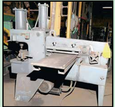
METAL MUNCHER MDL. MM61BC HYDRAULIC IRONWORKER

MILLER SYNCROWAVE MDL. 351 TIG WELDER, 350 amps @ 34 v., 40% duty cycle, foot pedal, cooler, TIG torch, S/N KD395572.