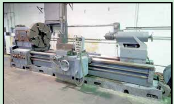
MEUSER 54" X 120" ENGINE LATHE