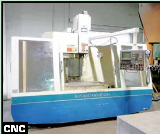
CNC REPUBLIC LAGUN MDL. 4824 CNC VERTICAL MACHINING CENTER