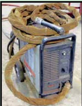
< HYPERTERM PORTABLE PLASMA CUTTER