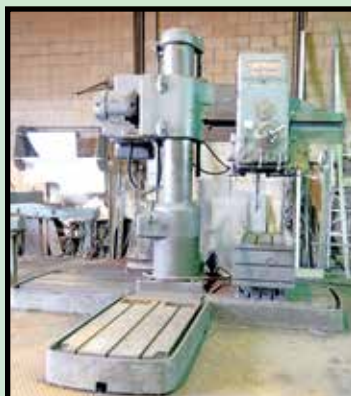
AMERICAN 4' X 13" RADIAL ARM DRILL