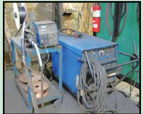
MILLER 650 AMP MIG WELDER