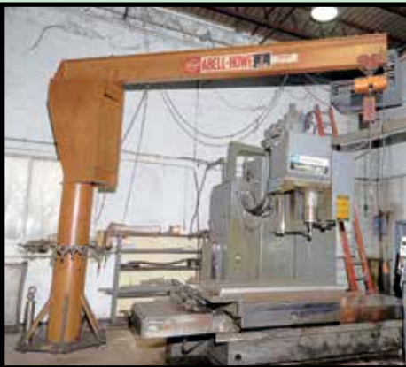
2 T. ABELL HOWE FREE-STANDING JIB CRANE

(2) HYSTER 11,050-LB. MAX. CAP. MDL. E100XLS , 111" max. lift ht., 36 v., S/N C09B-D03717U, S/N C09BD03719U, currently missing battery pack.