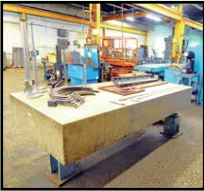
PARTIAL VIEW OF PRECISION INSTRUMENTS