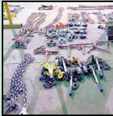
ASSORTED MATERIAL HANDLING EQUIPMENT