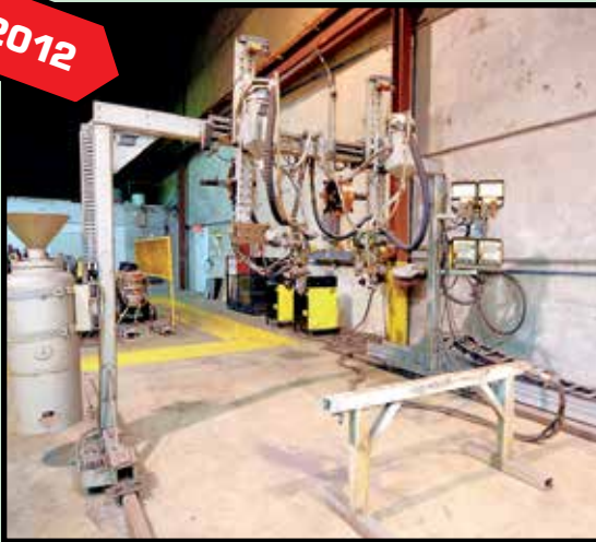
ESAB MECH-TRAC SUB-ARC WELDING GANTRY