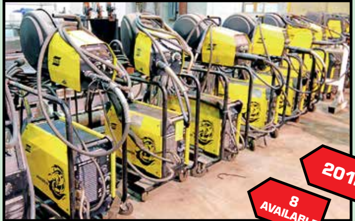
ESAB ORIGO MIG 410 WELDING MACHINES