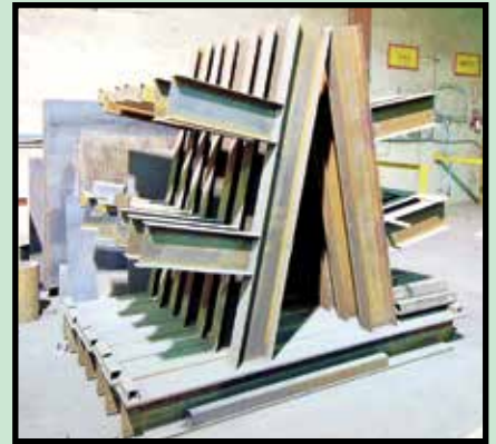
HEAVY FABRICATED STORAGE RACK