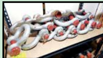
NEW HEAVY-DUTY SHACKLES