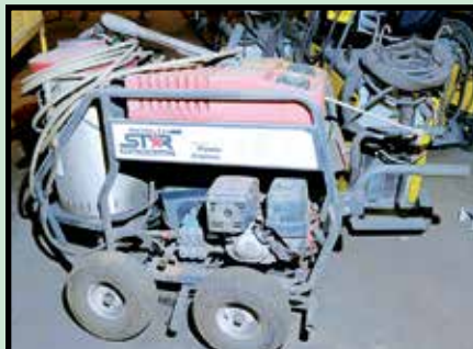
NORTHSTAR PRESSURE WASHER