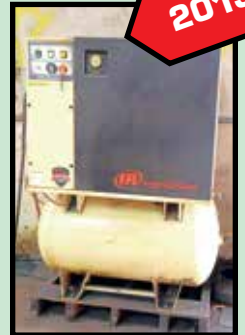
INGERSOLL-RAND 15 HP ROTARY SCREW AIR COMPRESSOR