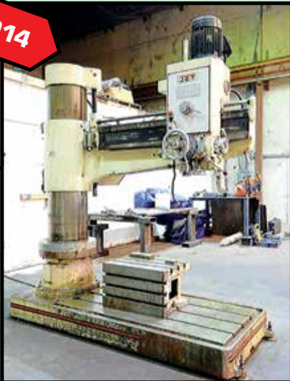
JET 5' X 15" RADIAL ARM DRILL