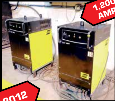
ESAB SUB-ARC WELDING POWER SUPPLIES