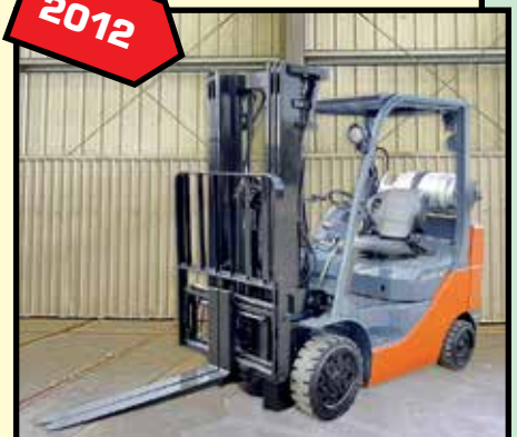
(2) TOYOTA 5,000-LB. CAP. FORKLIFTS