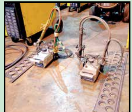
PROFAX TRACK TORCHES