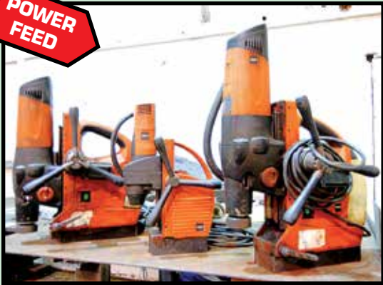
MAGNETIC BASE DRILLS