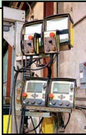
ESAB SUB-ARC WELDING CONTROLS

ESAB MECH-TRAC MDL. 3000 , new 2012, 120"W. bridge, dual bridge drive, 104" max. welding width, floor mtd. 2" sq. rail, (2) Esab Mdl. A2 single-wire sub-arc welding heads mtd. to 2-axis pwr. slide, worm drive head swivel, Esab flux boxes, Esab auto. seam tracker system on 2-axis slide, (2) Esab Mdl. LAF-1001 1,200 amp welding pwr. supplies, Esab central flux hopper feed system, Esab vacuum system, Esab desiccant air dryer system, currently arranged for 40' linear bridge travel (can be extended).