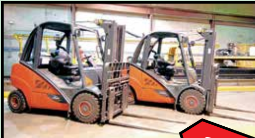
LINDE 7,000-LB. CAP. LPG FORKLIFTS

Read Partial Terms and Conditions on Back Page of Brochure