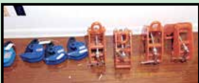
NEW PLATE AND BEAM CLAMPS