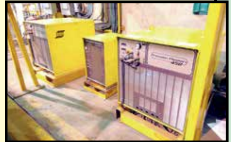
(2) ESAB PRECISION PLASMARC 410 POWER SUPPLIES AND WATER CHILLERS