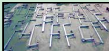
FORGED ADJUSTABLE C-CLAMPS