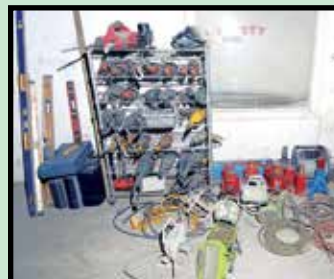
ASSORTED POWER AND HAND TOOLS