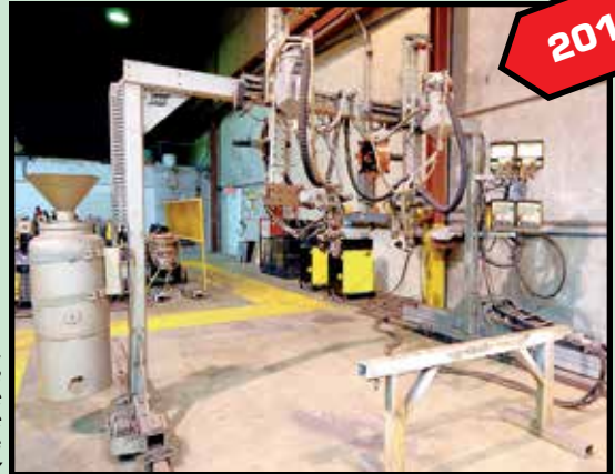
< ESAB DXG-4500 CNC PLASMA/ OXY-FUEL CUTTING MACHINE