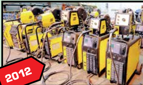
ESAB ORIGO MIG 410 WELDING MACHINES