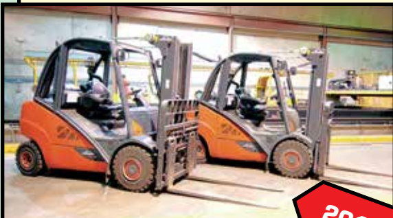
LINDE 7,000-LB. CAP. LPG FORKLIFTS

(2) HYSTER 3,000-LB. CAP. MDL. H30FT , LPG, 62" standard mast, 90" lift ht., S/N F001V02442E (new 2007), S/N F001V02050D (new 2006).