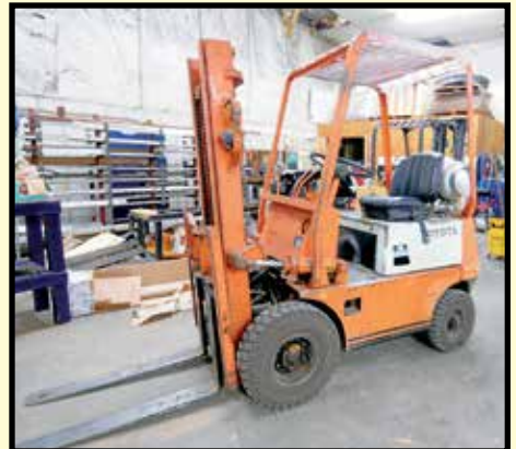
TOYOTA 3,300-LB. CAP. LPG FORKLIFT