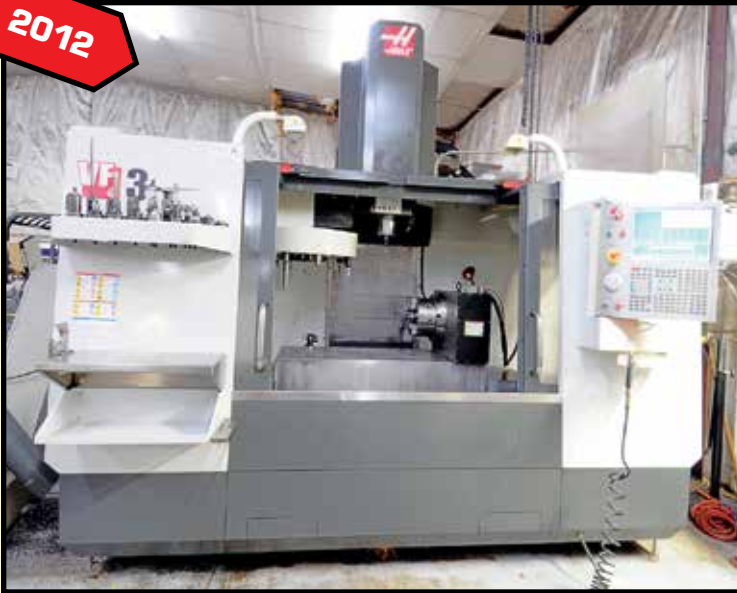
HAAS MDL. VF-3 4-AXIS VERTICAL MACHINING CENTER