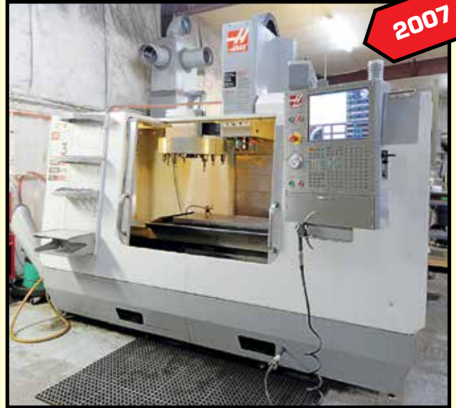
HAAS MDL. VF-3B 4-AXIS VERT. MACHINING CENTER