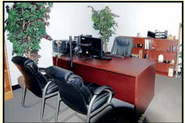
ASSORTED OFFICE FURNITURE