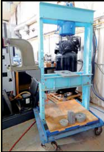
< DAKE 50 T. CAP. H-FRAME ARBOR PRESS

42" X 72" DOUBLE PEDESTAL EXECUTIVE DESK W/ MATCHING SHELF UNITS; 36" X 72" CONFERENCE TBL. W/(6) SWIVEL CHAIRS; EXECUTIVE ROLLER CHAIRS; SECRETARIAL L-SHAPED DESK in cherry wood finish; WIRE RACKING.