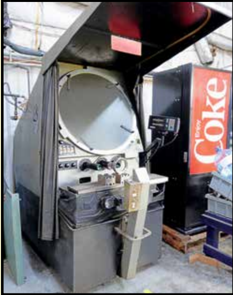
S.T. INDUSTRIES 30" OPTICAL COMPARATOR

INSPECTION: Wednesday, August 16, 9:00 A.M. to 4:00 P.M.