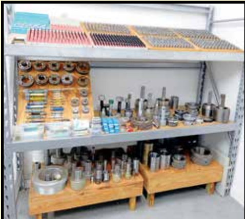
VIEW OF RING, PLUG, AND PIN GAGES