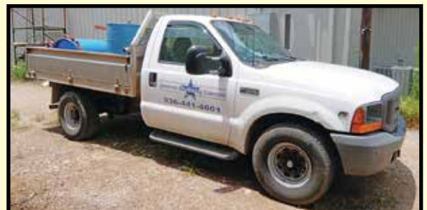
FORD F-350 FLATBED TRUCK