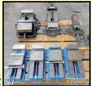
> KURT AND PALMGREN VISES