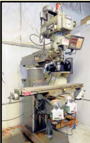
LAGUN MDL. FTV-2S VERT. TURRET MILLING MACHINE