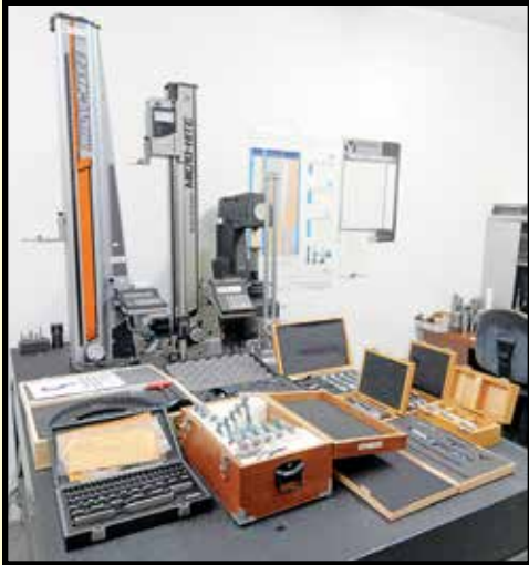
PARTIAL VIEW OF INSPECTION EQUIPMENT