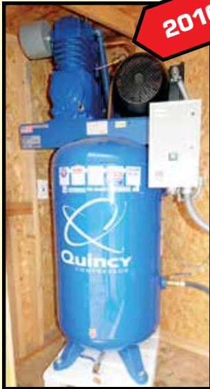
QUINCY 7.5 HP RECIPROCATING AIR COMPRESSOR