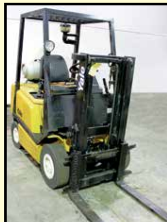
< (1 OF 2) YALE 3,000-LB. CAP. FORKLIFTS