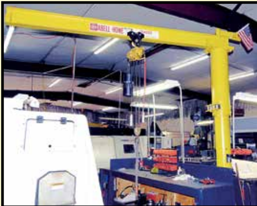
ABELL-HOWE FREE-STANDING PEDESTAL JIB CRANE

At the Premises of ACCURATE MACHINING CONCEPTS