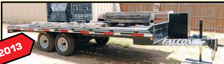
FALCON TANDEM-AXLE TRAILER