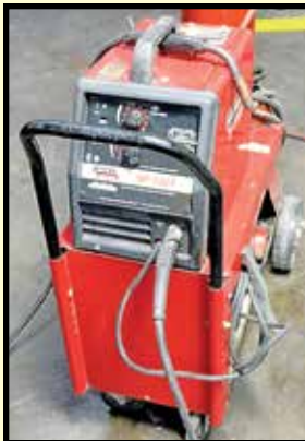
LINCOLN MIG WELDING MACHINE