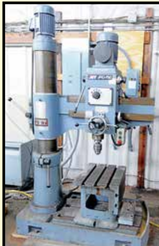
JET RADIAL ARM DRILL