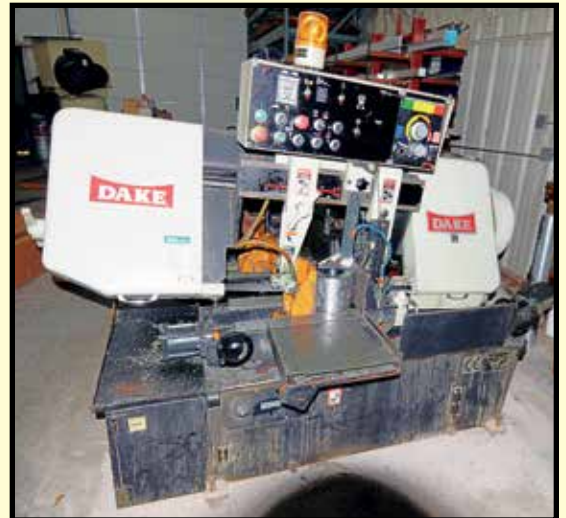
DAKE MDL. LE13A AUTOMATIC HORIZ. BANDSAW

LINCOLN MDL. SP130T , 130 amp @ 20 v., 30% duty cycle, integrated wire feeder, running gear, S/N U1930717490.