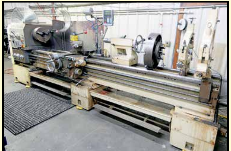
GMC GAP BED ENGINE LATHE