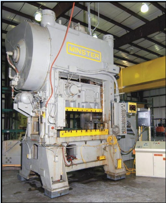
MINSTER 200 T. CAP. HIGH-SPEED STRAIGHT SIDE PRESS