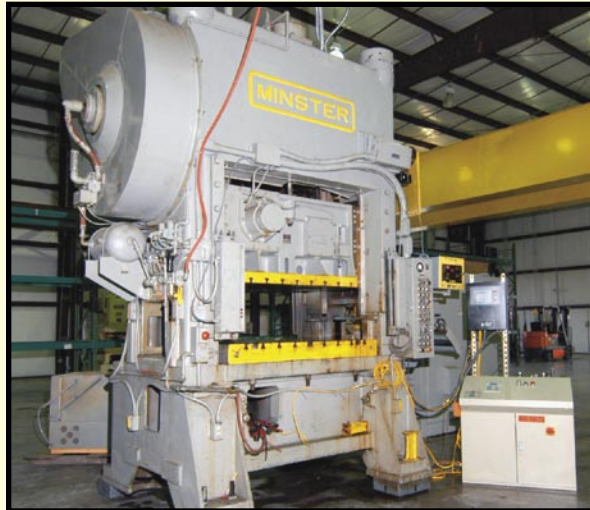
< MINSTER 200 T. CAP. HIGH-SPEED STRAIGHT SIDE PRESS

Featuring: Late Mdl. Minster Presses, Bliss High-Speed Press, Servo Feed Equipment, OBI Presses, Straighteners, Horizontal Coil Feeders, Coil Reels, Horizontal Bandsaw, Late Model Die Making Machinery Incl. CNC Vertical Machining Center, Charmilles Robofil EDMs, Vertical Milling Machines, Surface Grinders, C-Frame Press, CMMs, Optical Comparators, Precision Instruments, Furnaces, Air Compressors, Forklifts, Electric Die Lifts, Overhead Cranes, Much More! PLUS Real Estate for Sale by Private Negotiation (Subject to Prior Sale)