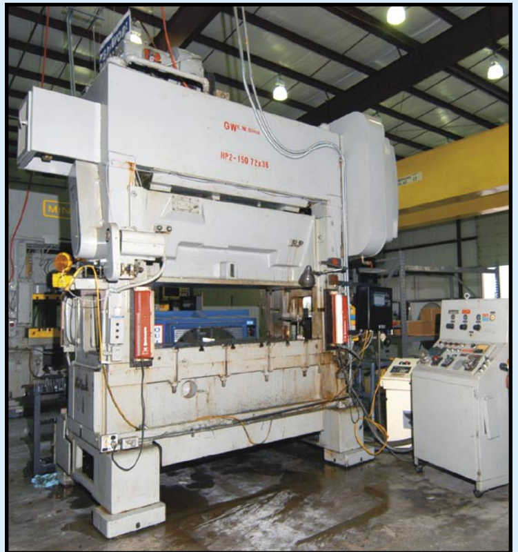
BLISS 150 T. CAP. HIGH-SPEED STRAIGHT SIDE PRESS