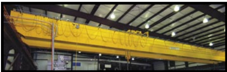
NORTH AMERICAN 25 T. CAP. DOUBLE GIRDER OVERHEAD BRIDGE CRANE