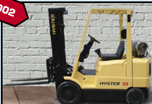
HYSTER 5,000-LB. CAP. FORKLIFT