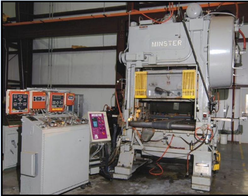
MINSTER 100 T. CAP. HIGH-SPEED STRAIGHT SIDE PRESS