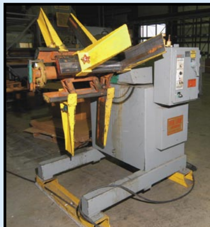
FEED LEASE 4,000 LB. COIL REEL