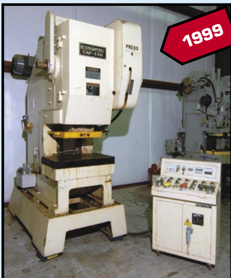
STAMTEC 45 T. CAP. HIGH-SPEED GAP PRESS

MINSTER 45 T. CAP. , Mdl. 5, 4" stroke, 2.75" adj., 10.75" shut ht., 120 SPM, 28" x 18" bolster, Reeves type variable spd. drive, dual palm button controls, light curtain safety device, Link System 2500 programmable limit switch, Link System 1100 tonnage monitor, S/N 5-21104.