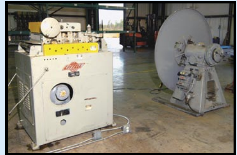
LITTELL COIL REEL & STRAIGHTENER