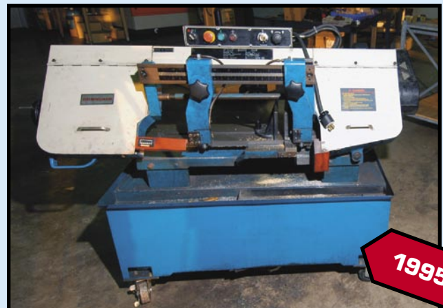
BIRMINGHAM HORIZONTAL BANDSAW