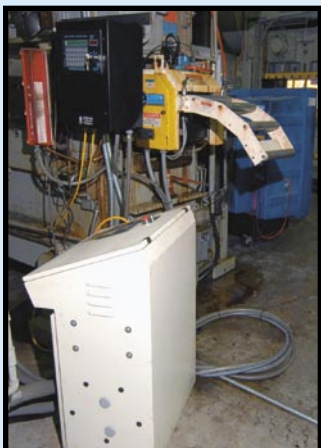
COE SERVO ROLL FEEDER

WILTON , 6"W. swivel belt, 12" disc sander, both w/tilting tbls., cabinet base.