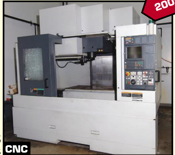
> MORI SEIKI NV5000 B/40 VERTICAL MACHINING CENTER