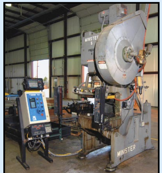
MINSTER #5 OBI PRESS & SERVO COIL FEEDER