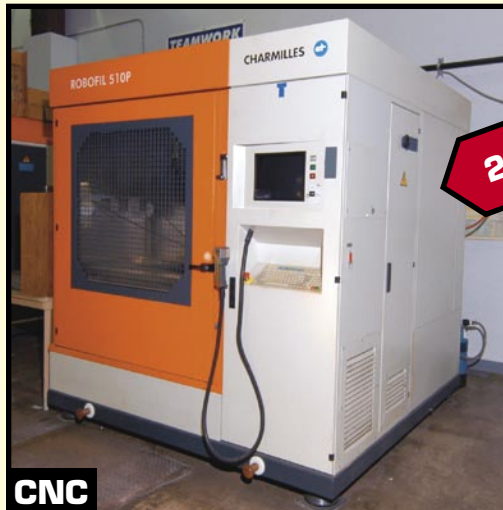
< CHARMILLES ROBOFIL 510 5-AXIS CNC WIRE EDM