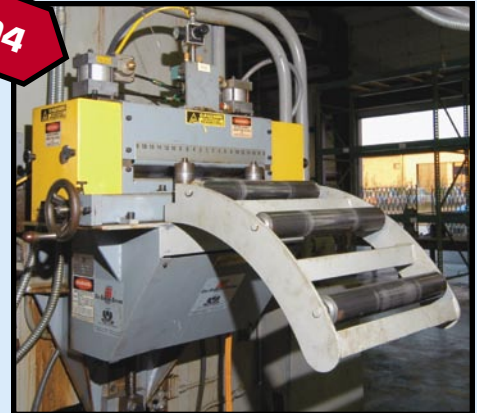
COIL HANDLING SYSTEMS SERVO ROLL FEEDER