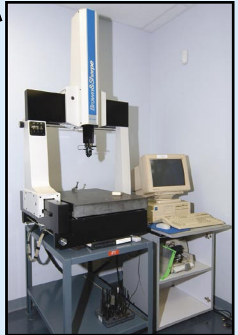
BROWN & SHARPE MICROVAL 454 MANUAL CMM