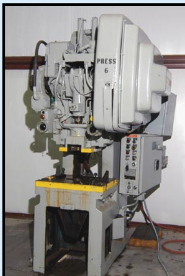
BLISS 35 T. CAP. HIGH-SPEED GAP PRESS