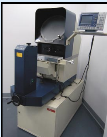
MITUTOYO OPTICAL COMPARATOR

CUSTOM RATCHET STYLE ARBOR PRESS ; MILLING VISES ; CLAMPING KITS ; R-8 COLLETS ; CAT-40 TOOLHOLDERS ; FASTENERS ; HAND TOOLS ; ASSORTED ELECTRIC POWER TOOLS ; EXPENDABLE TOOLING ; WORKBENCHES ; SANDERS ; DOUBLE END GRINDER .