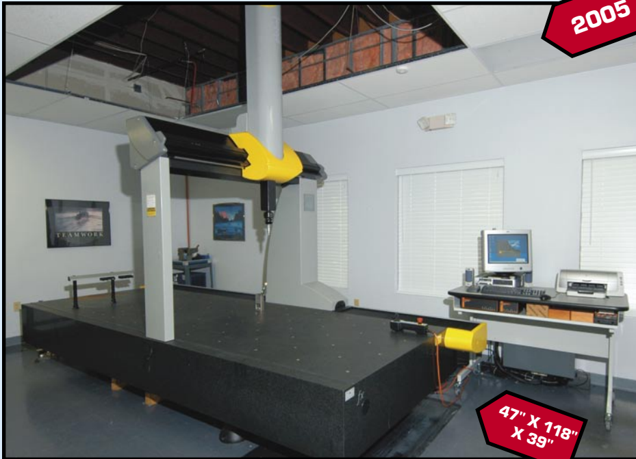
BROWN & SHARPE GLOBAL FX-123010 DCC CMM