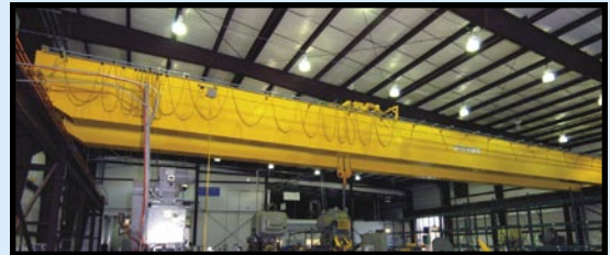
NORTH AMERICAN 25 T. CAP. DOUBLE GIRDER OVERHEAD BRIDGE CRANE