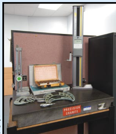
PARTIAL VIEW OF PRECISION INSTRUMENTS