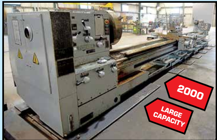
POREBA 36" X 236" GAP BED ENGINE LATHE