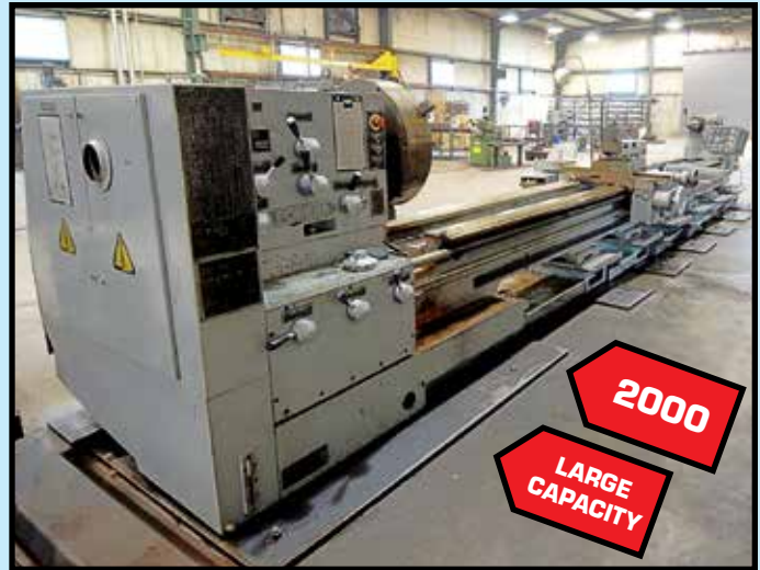
POREBA 36" X 236" GAP BED ENGINE LATHE

(3) SETS OF FABRICATED ANGLE PLATES: (1) 16"W. x 59"Ht. x 28" D. dbl. sided, (1) 16"W. x 37"Ht. x 19"D. and (1) 8"W. x 20"Ht. x 11-1/2" D.; (2) SINGLE FABRICATED ANGLE PLATES: (1) 20"W. x 16"Ht. x 12"D. and (1) 36"W. x 24"Ht. x 12"D.; 46-3/4"W. X 11"D. X 16"HT. PRECISION RISER; CRITERION NO. 50 TAPER BORING HEAD; NA-REX CONTINUOUS FEED BORING ATTACHMENT w/accessories.