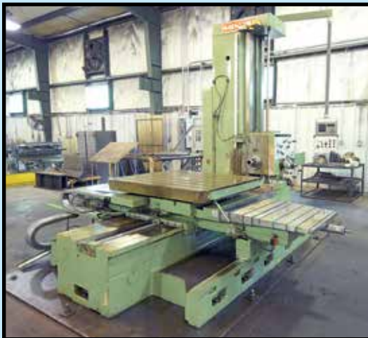
< MAGNA-MILL 4" HORIZ. BORING MILL

Featuring: Late-Model Manual Machine Tools, Fabricating Machines, Welders, Shop Tools & Much, Much More