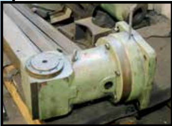
MAGNA-MILL RIGHT ANGLE HEAD

MAGNA-MILL MDL. HBM-4T , new 1996, 4" spndl. dia., No. 50 NST spndl. taper, spds.: 9–1,000 RPM, 15 HP spndl. drive motor, 24.8" spndl. travel, 64.96" headstock vert. travel, 70.86" tbl. cross travel, 64.96" tbl. long. travel, 43.3" x 55.1" tbl., 8,800 lb. max. tbl. load, angular milling attach., rotating spndl. suppt., facing head, assorted change gears, pwr. drawbar, Heidenhain 3-axis D.R.O., full function pendant, telescoping way guards, built-in tbl. outriggers, S/N 140437695.