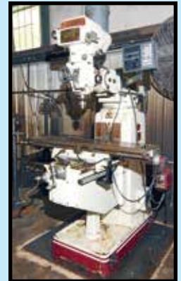
ACER VERTICAL TURRET MILLING MACHINE