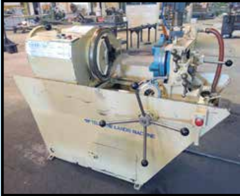
4" OSTER MDL. 754 PIPE THREADER

On-Site Bidding in Meridian, Mississippi or Bid Via Webcast at BidSpotter.com