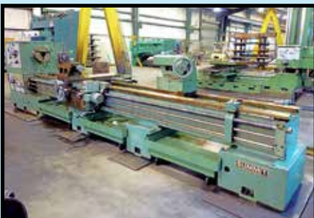
SUMMIT 30" X 160" ENGINE LATHE