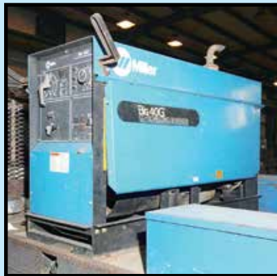
MILLER BIG 40G PORTABLE WELDER