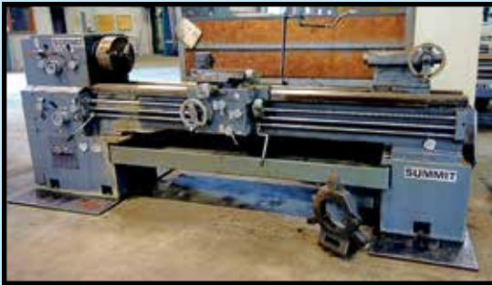
SUMMIT 19" X 80" GAP BED ENGINE LATHE