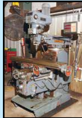
LAGUN MDL. FTV-4 VERTICAL TURRET MILLING MACHINE