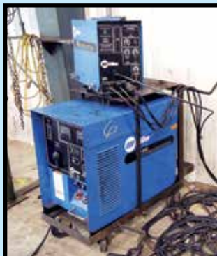
MILLER MIG WELDING MACHINE

72"L. FABRICATED STEEL HORSES , heavy I-beam construction.