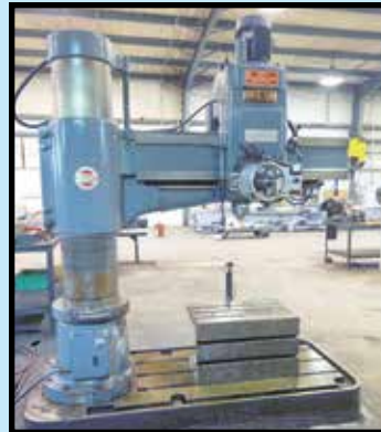
IKEDA 4' X 13" RADIAL ARM DRILL