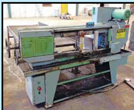
DOALL C-916M HORIZONTAL BANDSAW