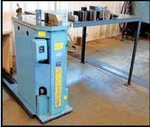
RICHARDS MULTI-FORM BENDING MACHINE