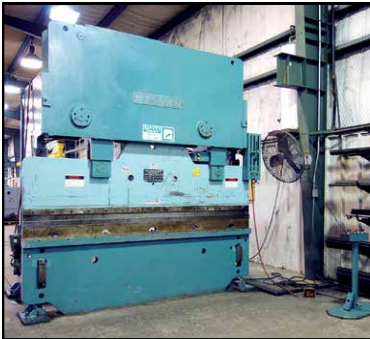
WYSONG 10' X 250 T. CAP. HYDRAULIC PRESSBRAKE