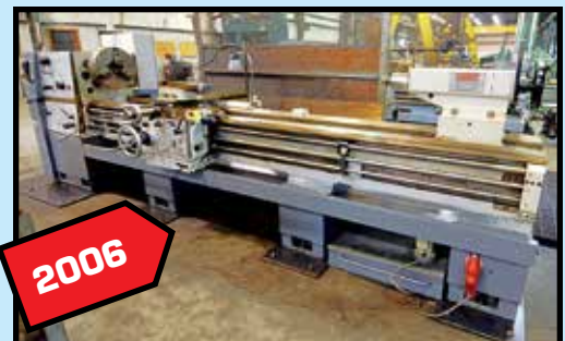
TOOLMEX/WAFUM 25" X 120" ENGINE LATHE