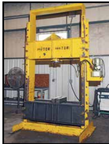
CUSTOM 150 T. CAP. HYDRAULIC H-FRAME PRESS

CUSTOM 150 T. CAP. , 62" dist. btwn. up- rights, adj. cross head and bed, 22"W. bed, Simplex elec. driven hyd. pump, approx. 66" max. dist. btwn. ram and bed.