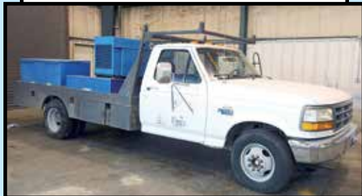
FORD F-350 FLAT BED TRUCK

1993 FORD MDL. F-350XL , 4-spd. manual trans. w/overdrive, gasoline engine, 84"W. x 144" steel bed, 5th wheel ball, standard tow hitch, MS Li- cense No. B1651634, VIN 1FDJF37H2REA09777.