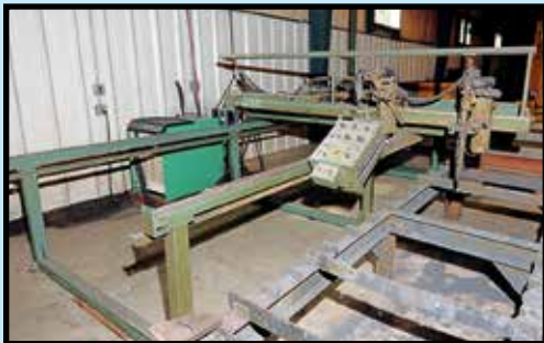
L-TEC OXY/FUEL/ PLASMA CUTTING MACHINE