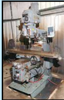
LAGUN MDL. FTV-5 VERTICAL TURRET MILLING MACHINE