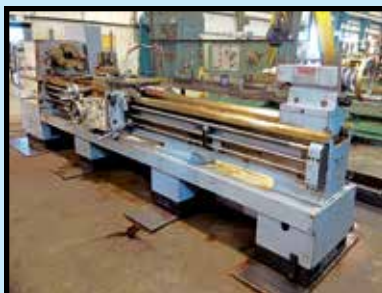
TOOLMEX/WAFUM 25" X 120" ENGINE LATHE