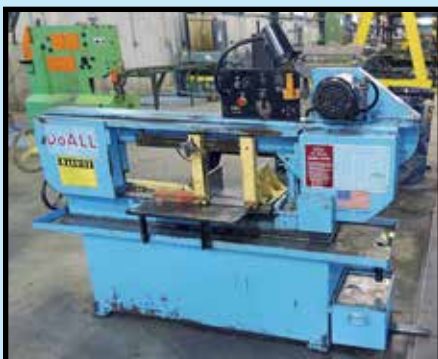
DOALL C-916M HORIZONTAL BANDSAW