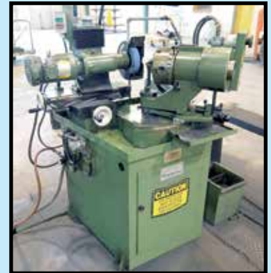
RUSH MACHINERY DRILL GRINDER