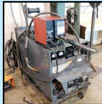
LINCOLN 600 AMP MIG WELDING MACHINE