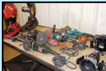
PARTIAL VIEW OF POWER TOOLS