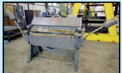
CHICAGO BOX AND PAN BRAKE