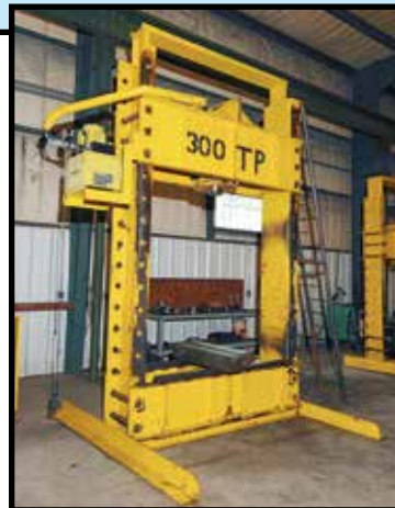
CUSTOM 300 T. CAP. HYDRAULIC H-FRAME PRESS