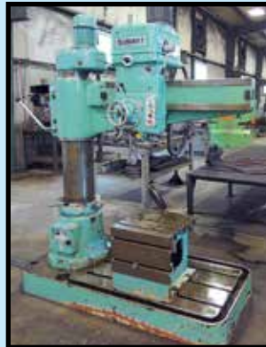
SUMMIT 3' x 9" RADIAL DRILL