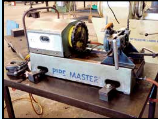
2" OSTER MDL. 655 PIPE THREADER