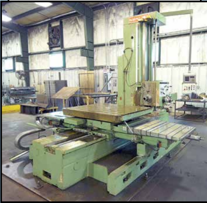
TABLE TYPE HORIZONTAL BORING MILL

MAGNA-MILL MDL. HBM-4T , new 1996, 4" spndl. dia., No. 50 NST spndl. taper, spds.: 9–1,000 RPM, 15 HP spndl. drive motor, 24.8" spndl. travel, 64.96" headstock vert. travel, 70.86" tbl. cross travel, 64.96" tbl. long. travel, 43.3" x 55.1" tbl., 8,800 lb. max. tbl. load, angular milling attach., rotating spndl. suppt., facing head, assorted change gears, pwr. drawbar, Heidenhain 3-axis D.R.O., full function pendant, telescoping way guards, built-in tbl. outriggers, S/N 140437695.