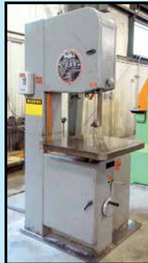
DOALL VERTICAL BANDSAW