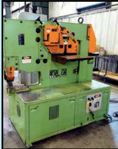
MUBEA HYDRAULIC IRONWORKER