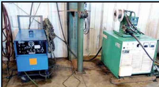
MILLER AND L-TEC WELDERS