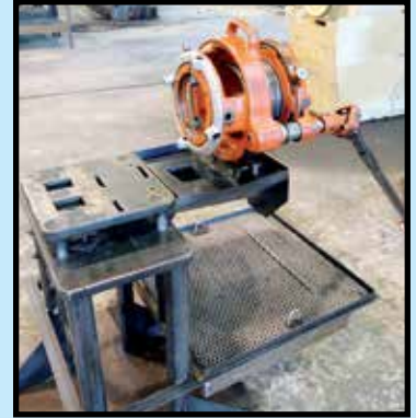
RIDGID PIPE THREADING HEAD