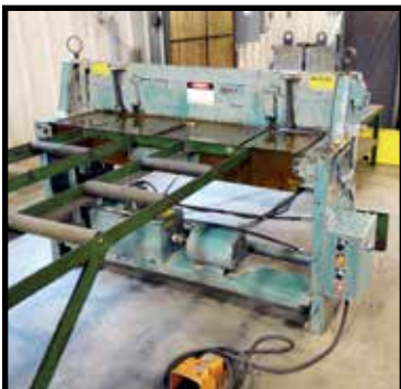
WYSONG 52" X 14 GA. POWER SHEAR

WYSONG 52" X 14 GA. MDL. H1452 , manual backgauge, front conveyor system, foot pedal control, S/N H1-166.