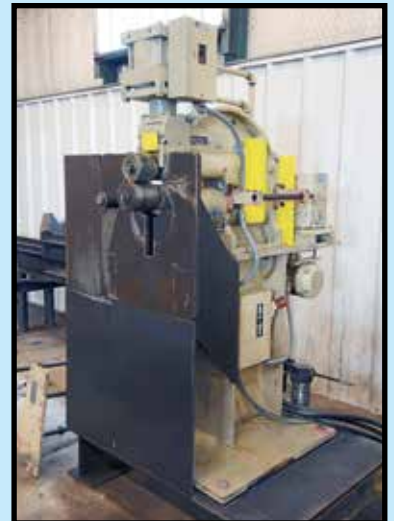
POWER COMBINATION MACHINE