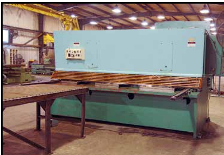
WYSONG 10' X 1/2" CAP. HYDRAULIC SHEAR