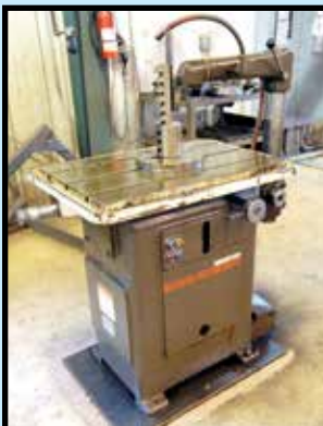
DAVIS MDL. 15 KEYSEATER