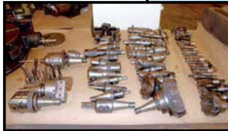
PARTIAL VIEW OF BORING MILL ACCESSORIES