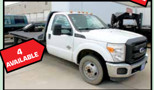
SAMPLE VIEW OF FLATBED TRUCKS