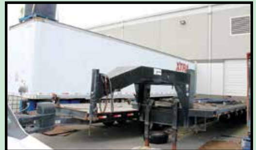
SAMPLE VIEW OF ASSORTED TRAILERS

See Back Page for Equipment Location Index