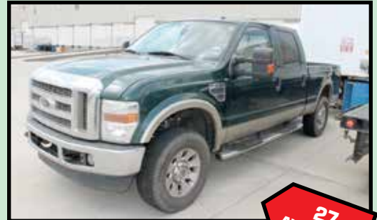
SAMPLE VIEW OF PICKUP TRUCKS