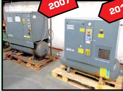
VIEW OF ATLAS COPCO AIR COMPRESSORS