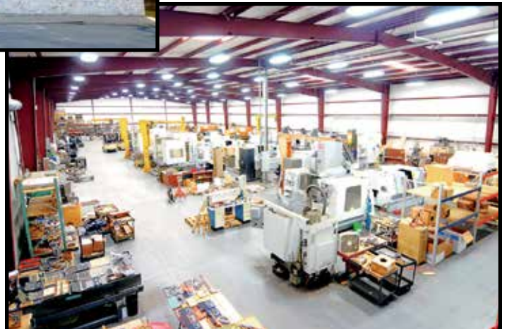
OVERALL VIEW OF MACHINE SHOP FACILITY