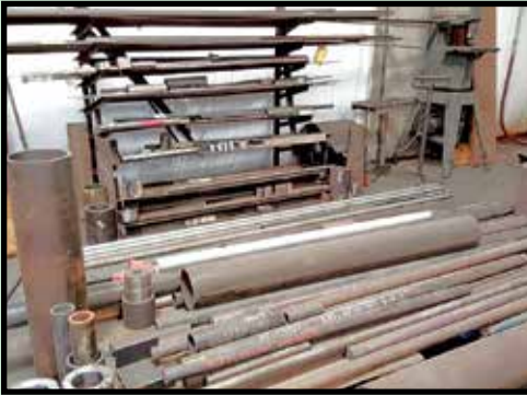
SAMPLE VIEW OF RAW MATERIALS