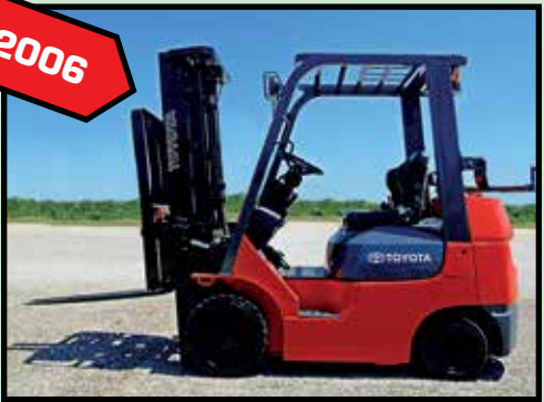
TOYOTA 8,000-LB. CAP. FORKLIFT