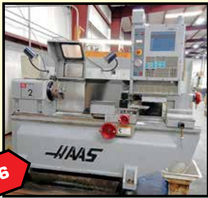
> HAAS TL-2 CNC TOOLROOM LATHE