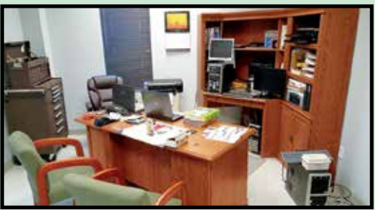
> SAMPLE VIEW OF OFFICE FURNITURE