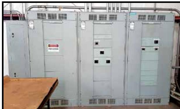
SAMPLE VIEW OF SIEMENS SWITCHGEAR

BUILDING: 18,000 SF freestanding metal building with 2,000 SF of office space. Built in 2005. 100% air conditioned. Floor is sealed. 3,000 amp/3-phase/480 v. heavy power with Siemens switchgear. Warehouse/Industrial use. 22' ceiling height, clear span. Two drive-in/grade-level doors. Separate restrooms and kitchen areas in the offices.