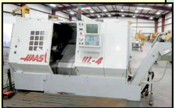
HAAS HL-4 CNC LATHE