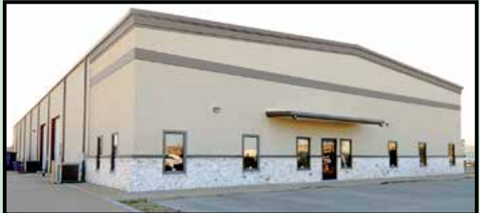
HIGH QUALITY INDUSTRIAL BUILDING FOR SALE