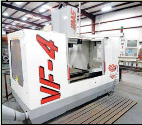
< HAAS VF-4 VERTICAL MACHINING CENTER

HAAS MINI-MILL , new 2001, Haas CNC control, 12" x 36" table, 16" X, 12" Y, 10" Z travels, CAT-40 spndl. taper, 6,000 RPM, 7.5 HP, 10-pos. ATC, S/N 24191.