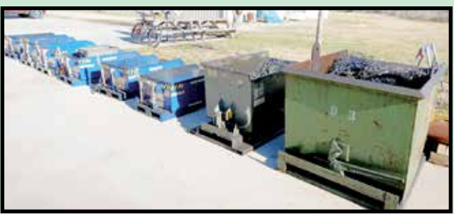
< SELF-DUMPING HOPPERS