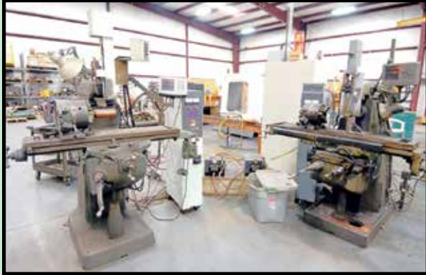
CUSTOM EDM DRILLS