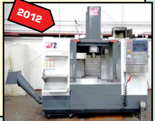
HAAS VF-2 VERTICAL MACHINING CENTER