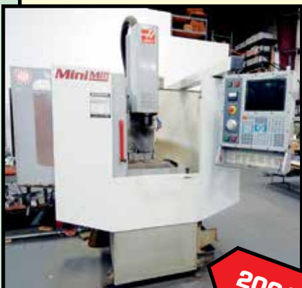
HAAS MINI-MILL VERTICAL MACHINING CENTER