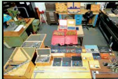
< PARTIAL VIEW OF PRECISION INSTRUMENTS

Read Partial Terms and Conditions on Back Page of Brochure