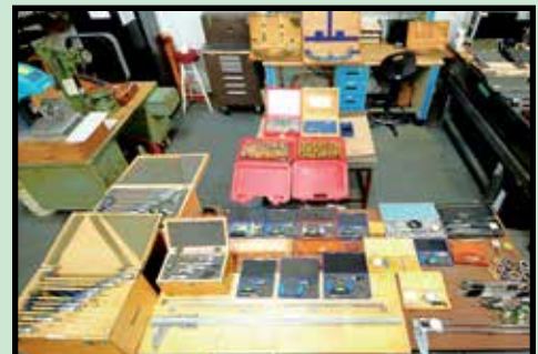
PARTIAL VIEW OF PRECISION INSTRUMENTS