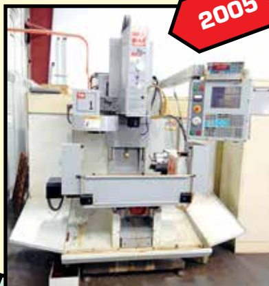
HAAS TM-1 VERTICAL MACHINING CENTER