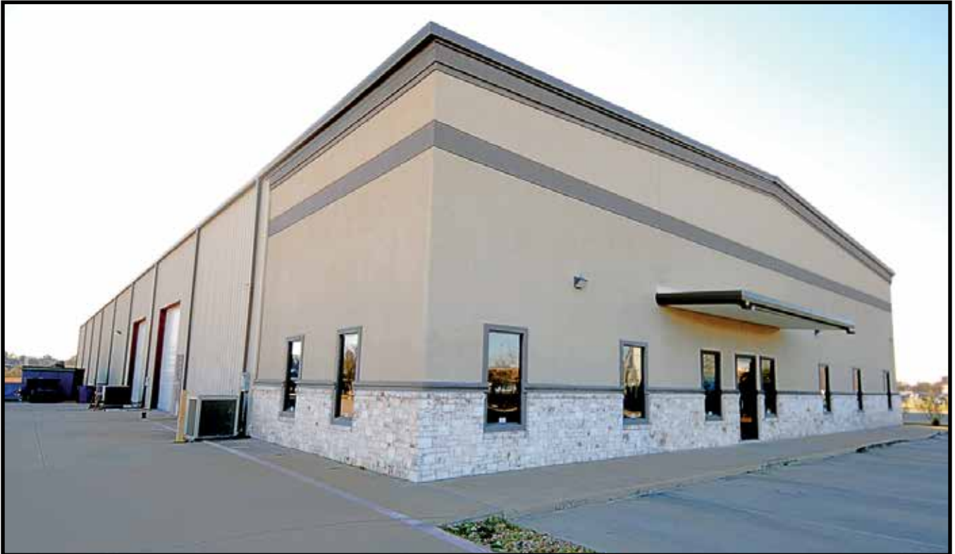
HIGH QUALITY INDUSTRIAL BUILDING FOR SALE

NO BUYER'S PREMIUM ON REAL ESTATE - ONSITE BIDDING ONLY