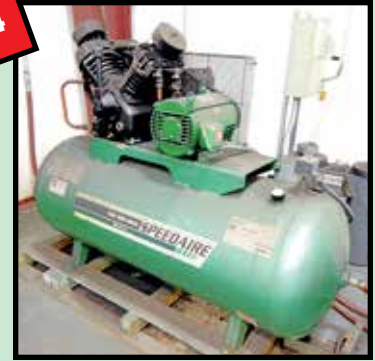
SPEEDAIRE RECIPROCATING COMPRESSOR

RAW MATERIAL LARGE QUANTITY OF BAR STOCK AND TUBE STOCK.