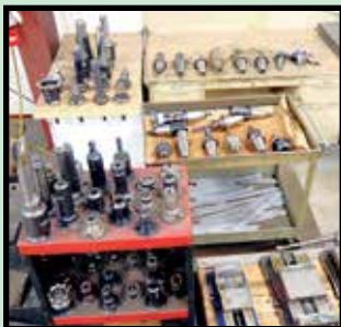
CAT-50 AND CAT-40 SPINDLE TOOLING

TOGOSHISEIKI MDL. 157 ROCKWELL HARDNESS TESTER; ASSORTED PIN GAUGE SETS; INTERCHANGEABLE ANVIL MICROMETERS from 16" to 20", 6" to 12" and 12" to 16"; (2) 1" TO 12" MICROMETER SETS; 1" TO 6" MICROMETER SET; BLADE MICROMETERS; THREAD PITCH MICROMETERS; DEPTH MICROMETERS; MITUTOYO 24" DIAL CALIPER; 40" VERNIER CALIPER; GAUGE BLOCKS; ANGLE BLOCKS; DIAL AND DIGITAL CALIPERS; BORE GAUGE SETS; 48" X 60" X 8" THK. 4-LEDGE GRANITE SURFACE PLATE, Grade B; BROWN & SHARPE 18" VERNIER HEIGHT GAUGE; SCHERR TUMICO 36" VERNIER CALIPER; MG 24" VERNIER CALIPER.