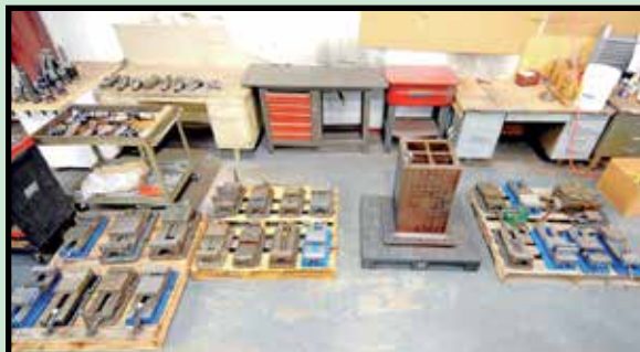
MACHINE SHOP ACCESSORIES