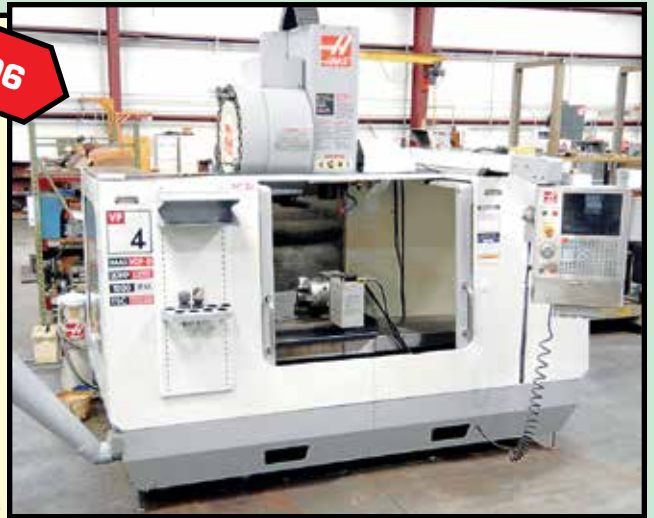
> HAAS VF-4B VERTICAL MACHINING CENTER