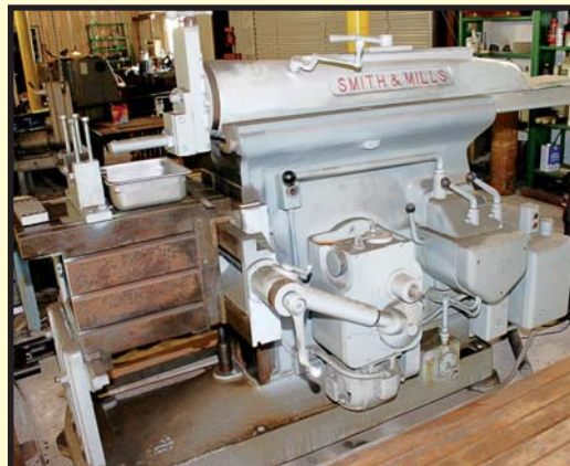
SMITH & MILLS 25" MECHANICAL SHAPER