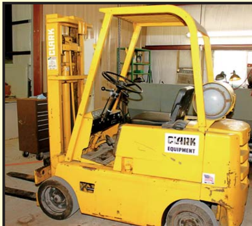
CLARK 4,000-LB. CAP. FORKLIFT