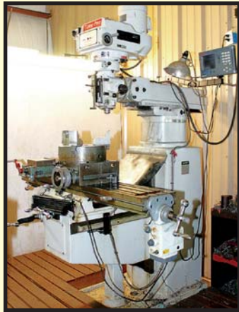
TURN-PRO GS18V VERTICAL TURRET MILL