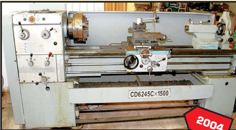
AMCO 20" X 60" GAP BED TYPE ENGINE LATHE

AUCTION: WEDNESDAY, MARCH 16 • 10:00 A.M.