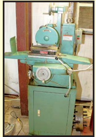
ENCO 5" X 10" HAND-FEED SURFACE GRINDER