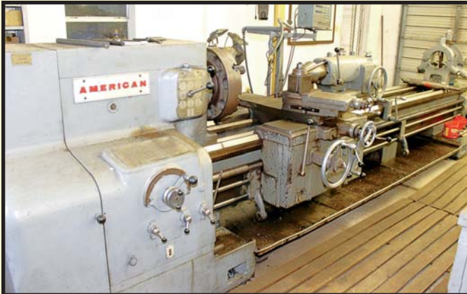
AMERICAN 26" X 120" ENGINE LATHE

Featuring: Engine & Turret Lathes, CNC Chucker, Jig Mill, CNC Vert. Mill, Horiz. & Vert. Mills, Vert. Turret Mills, Bold Circle Drill, Reciprocating Surface Grinders, Tool & Cutter Grinders, Belt/Disc Grinders, Vert. & Horiz. Bandsaws, Shop Support Equip., Air Compressors, Pedestal Jib Cranes, Forklift, Gooseneck Trailer, More!