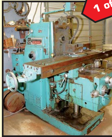
KEARNEY & TRECKER MILWAUKEE PLAIN HORIZONTAL MILL