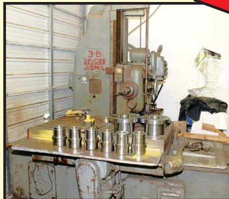
DEVLIEG 3-B JIG MILL

On-Site Bidding in Magnolia, Texas or Bid Via Webcast at BidSpotter.com