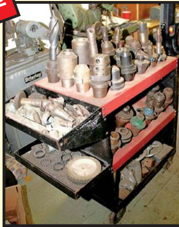
SAMPLE VIEW OF TOOLING AND ACCESSORIES