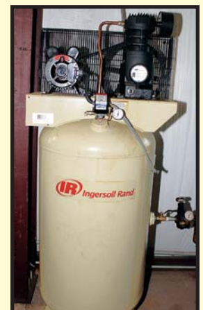
INGERSOLL RAND RECIPROCATING AIR COMPRESSOR