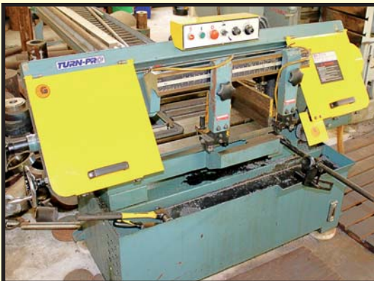
TURN-PRO BS-250A HORIZONTAL BANDSAW