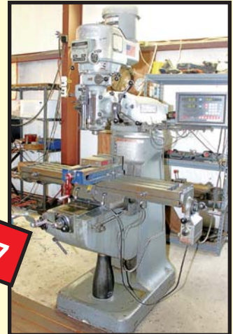
BRIDGEPORT VERTICAL TURRET MILL