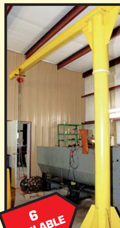
PEDESTAL JIB CRANE