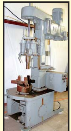
BABIN 12" BOLT CIRCLE DRILL