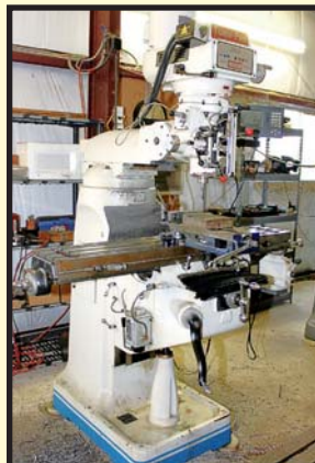
TURN-PRO GS15V VERTICAL TURRET MILL