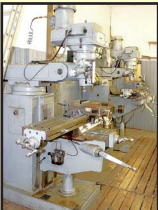
ENCO 100-1588 VERTICAL TURRET MILL

BARNES TWIN HEAD , 7' bed, 28" stroke, S/N N.A.