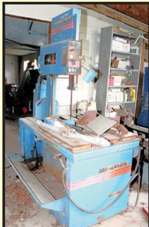
METAL MIZER 2018 VERTICAL BANDSAW

On-Site Bidding in Magnolia, Texas or Bid Via Webcast at BidSpotter.com