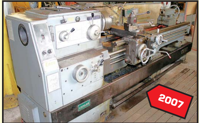
LONGEM 20" X 80" ENGINE LATHE