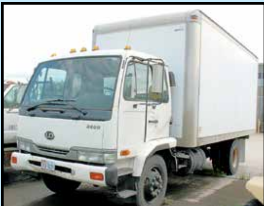
2000 NISSAN 18' BOX TRUCK