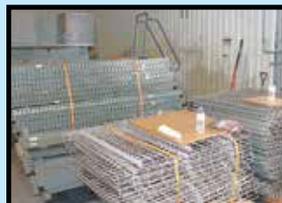
PALLET RACKING AND SHELVING INSERTS