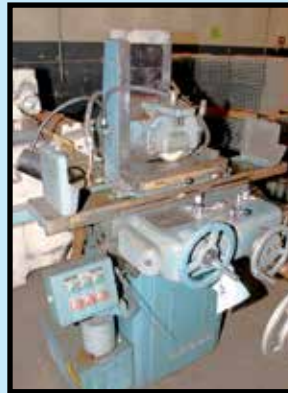
K.O. LEE RECIPROCATING SURFACE TYPE GRINDER