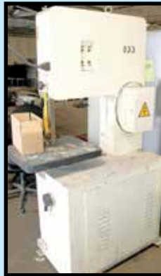
JET VERT. BANDSAW