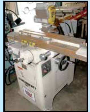
CINCINNATI TOOL AND CUTTER GRINDER