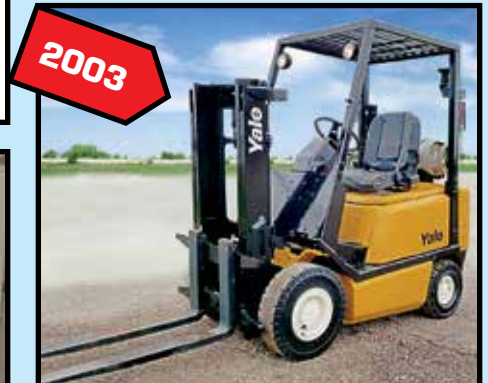
YALE 3,000-LB. CAP. FORKLIFT