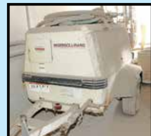
INGERSOLL-RAND PORTABLE AIR COMPRESSOR

This building has been sold. All machinery must be removed by Thursday, September 29. DON'T MISS THIS SALE!