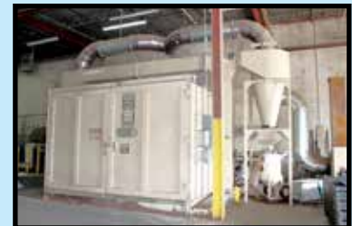
INDUSTRIAL CLEANING MACHINES 14' X 9' X 14' BLAST ROOM

On-Site Bidding in Houston, Texas or Bid Via Webcast at BidSpotter.com