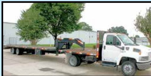
2006 GMC 10' L. FLATBED W/28' GOOSENECK TRAILER