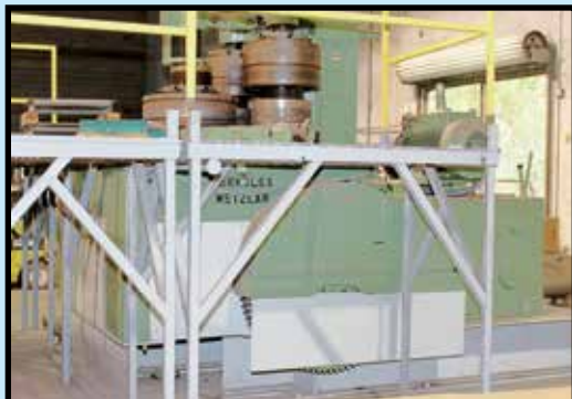
HERKULES 8" X 8" X 1" HORIZ. ANGLE BENDING ROLL

8" X 8" ANGLE ROLL; POWDER COAT PAINT SYSTEM; LARGE CAP. BLAST BOOTH; GRINDERS; E.D.M.; MISC. MACHINE TOOLS; 10,000 GAL. FUEL TRUCK; TRUCKS; TRAILERS; FORKLIFTS; AIR COMPRESSORS UP TO 100 HP; MATERIAL STORAGE & HANDLING EQUIP.; MUCH MORE!