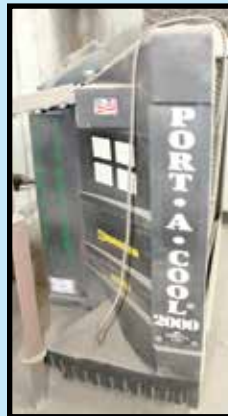
PORTA-COOL COOLING SYSTEM

SEE CATALOG—THIS IS ONLY A PARTIAL LISTING!!!