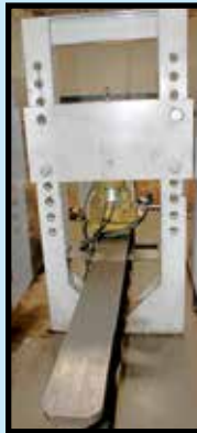
HYDRAULIC STRAIGHTENING PRESS