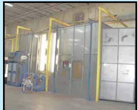
NORDSON POWDER COAT PAINT BOOTH