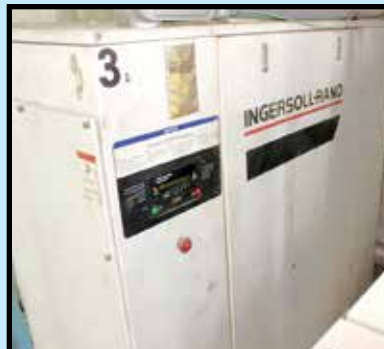
INGERSOLL-RAND 100 HP AIR COMPRESSOR