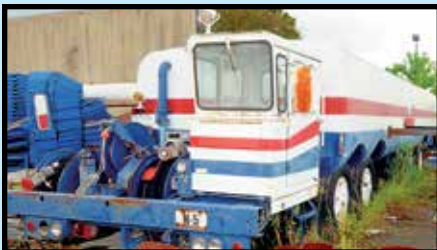
10,000 GAL. CAP. AIRCRAFT FUEL SERVICE TRUCK