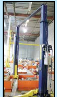
VEHICLE MAINTENANCE 2-POST STYLE LIFT SYSTEM