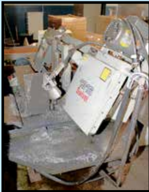
WELLSAW MDL. 1316 MITERING HORIZ. BANDSAW

HERKULES 8" X 8" X 1" HORIZONTAL MDL. BO-234K1 , 13'-2" x 8' x 78" ht. approx. dims., cap. in mild steel: 8" x 8" x 1" angles (let out), 6" x 6" x 1" angles (leg in), 8" x 7" tees (web out and web in), 9" x 7.5" tees (foot on edge), 18" x 7.5" beams on flanges, 17" x 4" channels (flanges out and flanges in), 14" x 2.5" flats on flat; 8" x 1-5/8" flats on edge; 4-3/4" x 4-3/4" squares, spds.: 13, 21, 33, 56 FPM, 40 HP motor