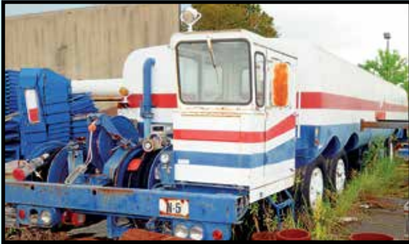
10,000 GAL. CAP. AIRCRAFT FUEL SERVICE TRUCK

SALE DATE: TUESDAY, SEPTEMBER 20 SEALED BID OPENING: 10:00 A.M. • EQUIPMENT AUCTION: 11:00 A.M.