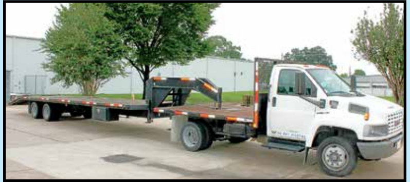
2006 GMC 10' L. FLATBED W/28' GOOSENECK TRAILER