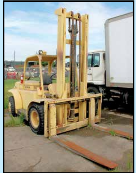
HYSTER 13,000-LB. CAP. FORKLIFT

INGERSOLL-RAND 100 HP MDL. SSR-EP100 , I-R Intellysis control panel, S/N CK096SU93174; INGERSOLL-RAND PORTABLE TRAILER TYPE.