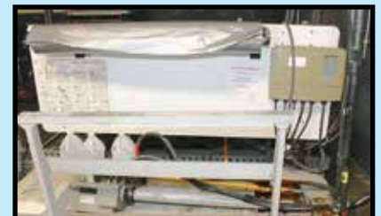
SEALED AIR INSTAPAK 901 FILLING BENCH

SALE DATE: TUESDAY, SEPTEMBER 20 SEALED BID OPENING: 10:00 A.M. EQUIPMENT AUCTION: 11:00 A.M.