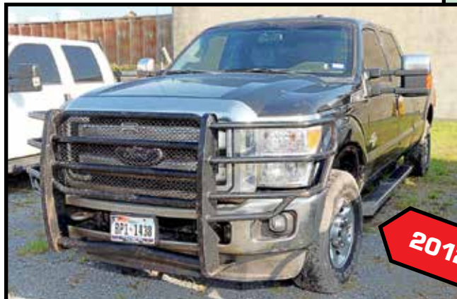
FORD LARIAT MDL. F-350 SUPER DUTY PLATINUM PICKUP TRUCK