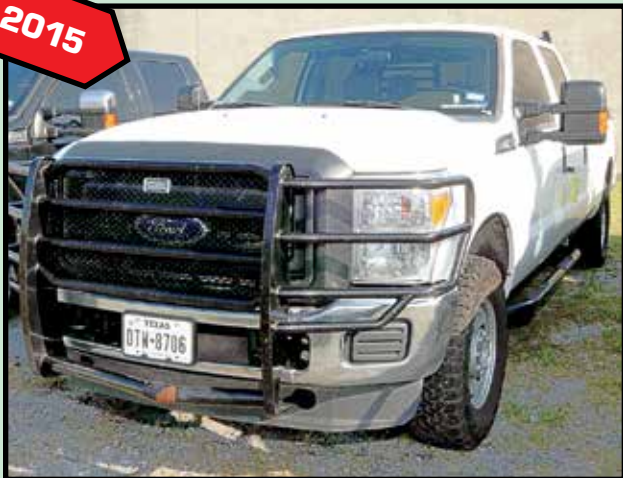
FORD MDL. F-250XL SUPER DUTY 4X4 OFF ROAD PICKUP TRUCK