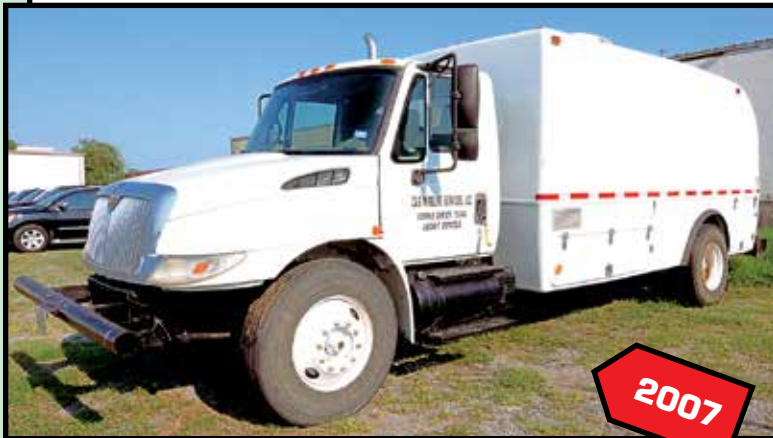
INTERNATIONAL 4300 SERIES WIRELINE TRUCK