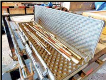
SAMPLE VIEW OF WIRELINER TOOLS

BUYER'S PREMIUM: 15% ON-SITE • 18% WEBCAST