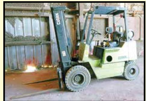
CLARK 4,000-LB. CAP. FORKLIFT

Read Partial Terms and Conditions on Back Page of Brochure