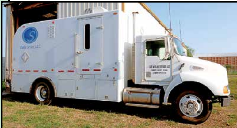
1999 KENWORTH WIRELINE TRUCK

By Order of the Secured Party C & S WIRELINE SERVICES Moved for Convenience of Sale to 233 Hereford Road CORPUS CHRISTI, TX 78408 (See Directions on Back Page)