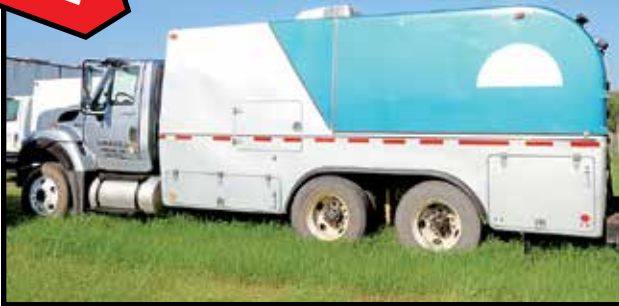
(1 OF 2) INTERNATIONAL MDL. WORKSTAR 7400 SERIES TRUCKS