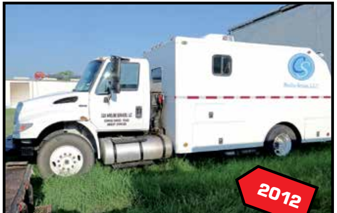
INTERNATIONAL 4300 SERIES WIRELINE TRUCK

1993 FORD MDL. F SUPER DUTY , dual rear tires, V-8 engine, 4-spd. trans. w/overdrive, Quick Rig slick line unit, boom attach. extends to 40', sgl. drum, 17' wireline, TX Lic. No. CA22663, VIN 2FDLF47M0PCA14409.