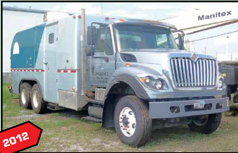
(1 OF 2) INTERNATIONAL MDL. WORKSTAR 7400 SERIES TRUCKS