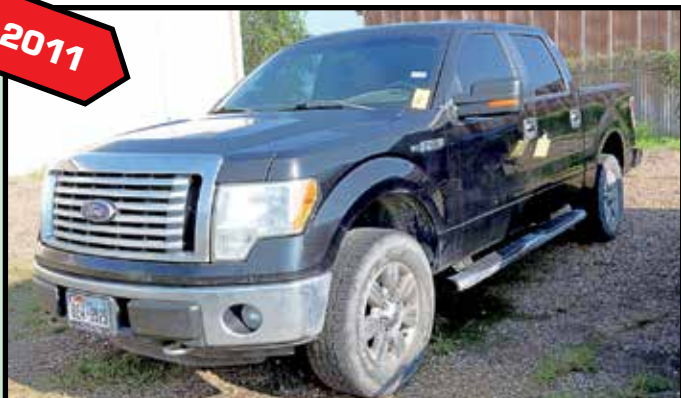
FORD MDL. F-150XLT 4X4 PICKUP TRUCK