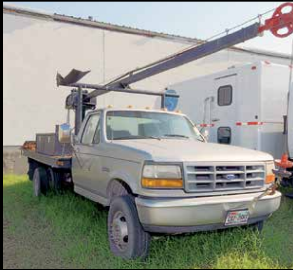
1993 FORD MDL. F SUPER DUTY QUICK-RIG TRUCK