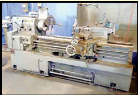
HWACHEON 17" X 60" GAP BED ENGINE LATHE

GALLMEYER & LIVINGSTON 8" X 24" MDL. 350 , incremental downfeed, 8" x 24" electromagnetic chuck w/Walker controller, coolant system.