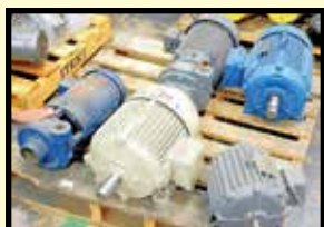
ASSORTED MOTORS AND PUMPS

INSPECTION: Wed., Nov. 9 9:00 A.M. to 4:00 P.M. & Morning of Sale