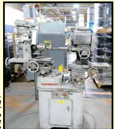
> CINCINNATI MONOSET TOOL AND CUTTER GRINDER