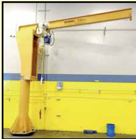
GORBEL 1 T. JIB CRANE