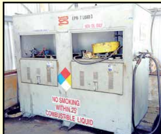
500 GAL. OIL STORAGE TANK