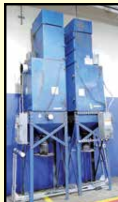
CABINET DUST COLLECTORS

SAMPLE VIEW OF AIRFLOW SYSTEMS MIST COLLECTORS