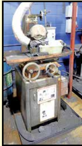
UNISON OMNIGRIND CENTERLESS GRINDER