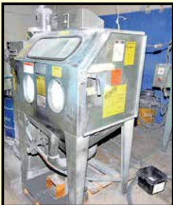
GLOVE BOX AND AUTOMATIC BLAST MACHINE