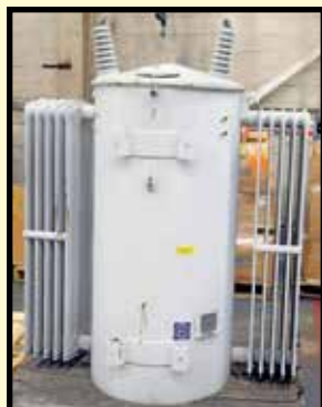
500 KVA TRANSFORMER

INSPECTION: Wed., Nov. 9 9:00 A.M. to 4:00 P.M. & Morning of Sale