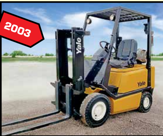
YALE 3,000-LB. CAP. FORKLIFT