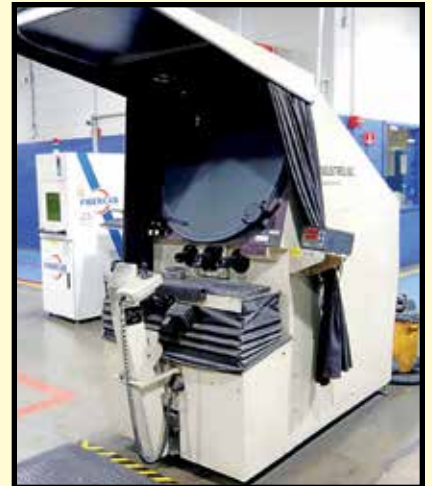
30" S.T. INDUSTRIES OPTICAL COMPARATOR