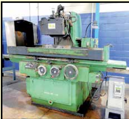
< BROWN & SHARPE 12" X 36" SURFACE GRINDER