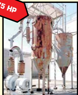
CYCLONE DUST COLLECTION SYSTEM