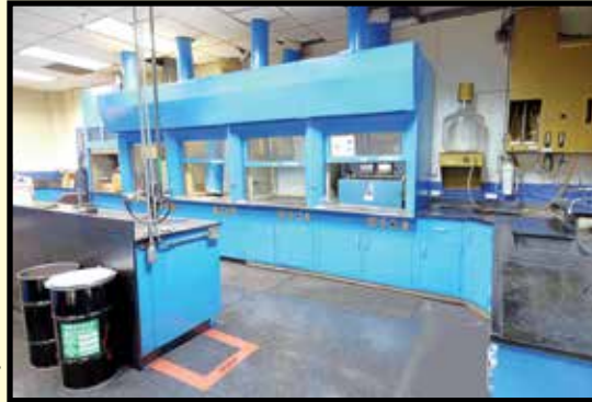
> OVERALL VIEW OF WET LAB

At the Premises of KENNAMETAL INC. 4435 West 12th Street HOUSTON, TEXAS 77055 (See Directions on Back Page)