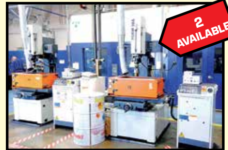
CHARMILLES FORM 20A MANUAL RAM-TYPE EDM MACHINE