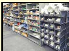
PLANT MAINTENANCE COMPONENTS