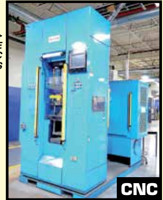
> 70 T. TELEDYNE CNC POWDER PRESS

On-Site Bidding in Houston, Texas or Bid Via Webcast at BidSpotter.com