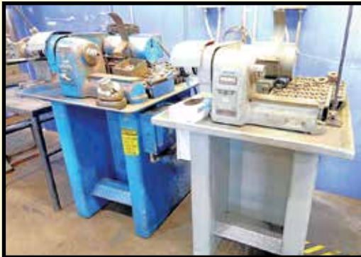
< HARDING MDL. HSL SPEED LATHES

MILLER ECONOTWIN MDL. HF ARC WELDER , 150 amps @ 25 v. rated output, 60% duty-cycle, S/N N.A.