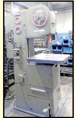
DOALL MDL. 1612-1 VERT. BANDSAW