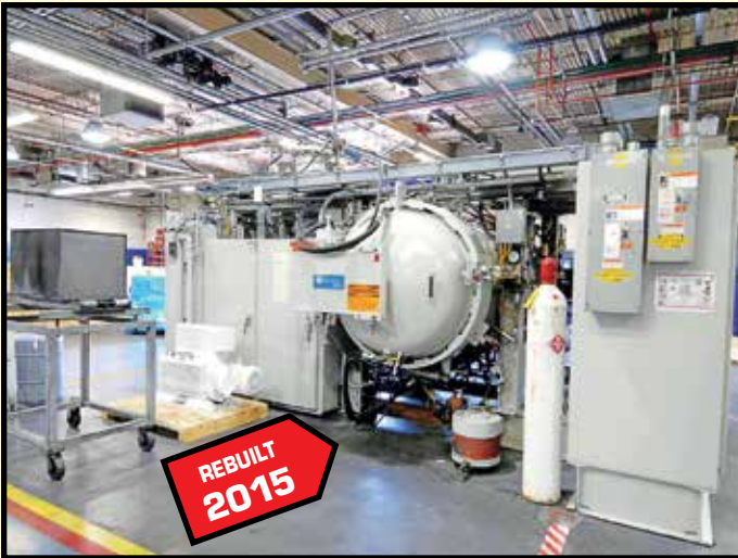
ULTRATEMP SINTER HIP HEAT TREAT FURNACE (#1400)