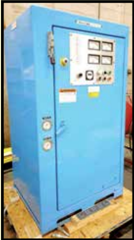
< LAPEL INDUCTION HARDENING SYSTEM