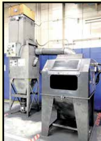
< SANDING BOOTH W/DUST COLLECTOR