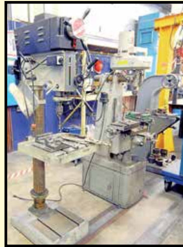
VIEW OF MISCELLANEOUS MACHINES