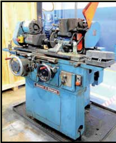
BROWN & SHARPE 8" X 24" UNIVERSAL CYLINDRICAL GRINDER