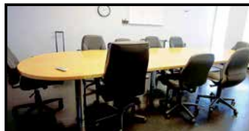
CONFERENCE TABLE AND CHAIRS