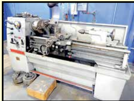
COLCHESTER 15" X 50" ENGINE LATHE