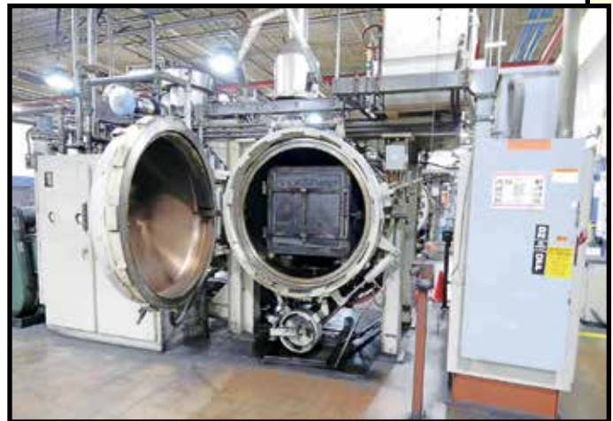
ULTRATEMP SINTER HIP HEAT TREAT FURNACE (#1100)

ULTRATEMP SINTER HIP , new 1986, Stokes vacuum pump, 1,600 deg. Celsius max. temp., 1,400 deg. Celsius nominal operating temp., 300 PSI max. pressure, 500 kg max. load, approx. 66"L. x 30-1/2"W. x 31" ht. coffin size, (3) heating zones, Honeywell HC-900 furnace controls, WSF Industries 42" dia. x 80"L. shell, new spare insulation package and assorted replacement parts, S/N 15117 (Note: Referred to as Sinter Hip No. 1100).