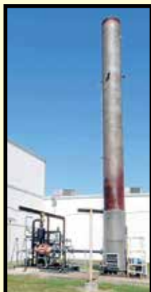
VOLATILE COMPOUND FLARE

YALE 3,500-LB. CAP. MDL. NR035AANL24SV089 , 24 v., 3,500 lb. cap. @ 24" L.C., 135" max. ht., battery charger.