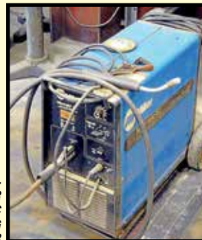
> MILLER MILLERMATIC MDL. 150 MIG WELDER

At the Premises of KENAMETAL INC. 4435 West 12th St., HOUSTON, TX 77055