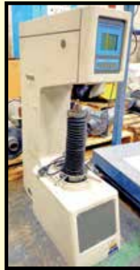
LECO DIGITAL HARDNESS TESTERS