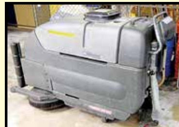
ADVANCE I-MAX FLOOR SCRUBBER

On-Site Bidding in Houston, Texas or Bid Via Webcast at