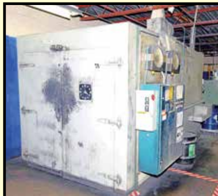
DESPATCH STYLE PSC3-24R CABINET OVEN