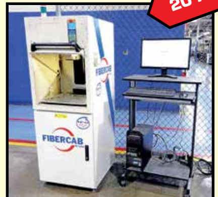
LASER MARKING MACHINE