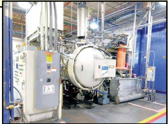
ULTRATEMP SINTER HIP HEAT TREAT FURNACE (#700)