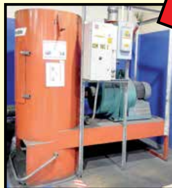
INVINCIBLE CENTRAL VACUUM SYSTEM