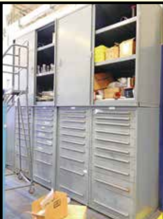
EQUIPTO ROLLER DRAWER CABINET SET