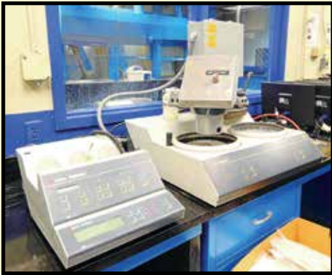
STRUERS LAB EQUIPMENT