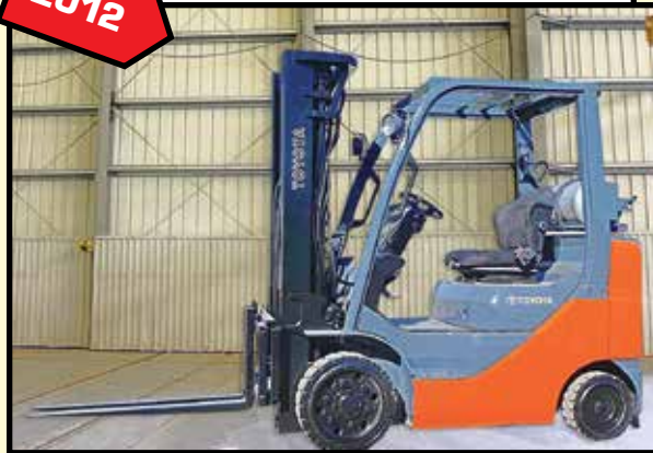
(1 OF 2) TOYOTA 5,000-LB. CAP. FORKLIFTS