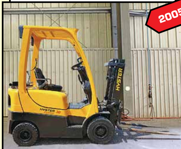
HYSTER 3,000-LB. CAP. FORKLIFT