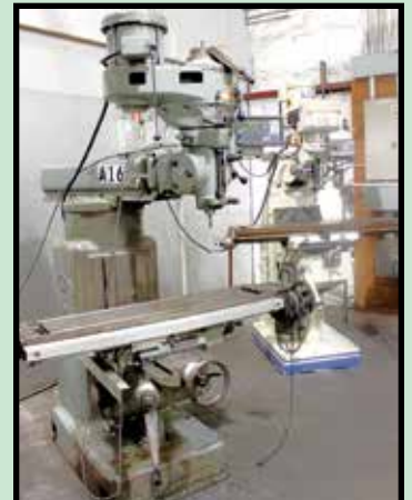
PARTIAL VIEW OF TURRET MILLS

On-Site Bidding in Porter, Texas or Bid Via Webcast at