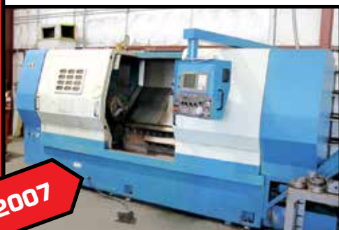
FEMCO MDL. HL-55S CNC LATHE