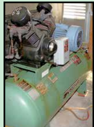
(1 OF 2) SPEEDAIRE 10 HP AIR COMPRESSORS

INSPECTION: Monday, March 27, 9:00 A.M. to 4:00 P.M. & Morning of Sale