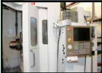
HAAS MDL. EC1600 HORIZONTAL MACHINING CENTER