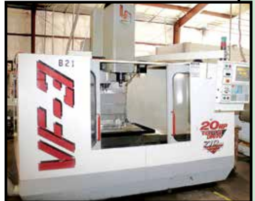
HAAS MDL. VF3 VERT. MACHINING CENTER