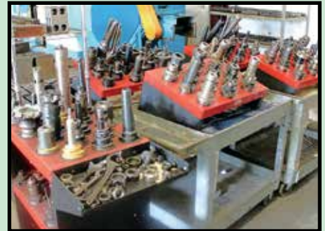
SAMPLE VIEW OF TOOLING