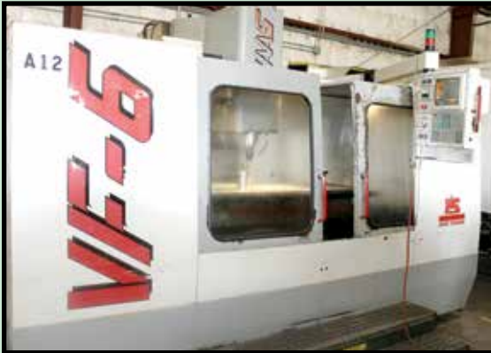
HAAS MDL. VF6 VERT. MACHINING CENTER