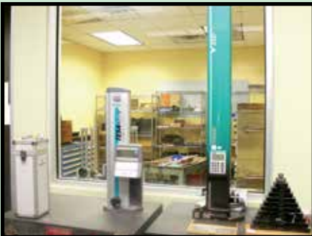
ELECTRONIC HEIGHT GAUGES