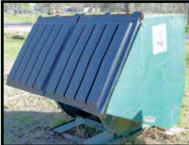
(1 OF 4) TILTING HOPPERS W/COVERS

2006 DODGE RAM 2500 MEGA CAB , 3/4 T. cap., Cummins turbo diesel engine, bed liner, bed mtd. toolbox, TX License No. BC16231, VIN 3D7KR29C26G208835.