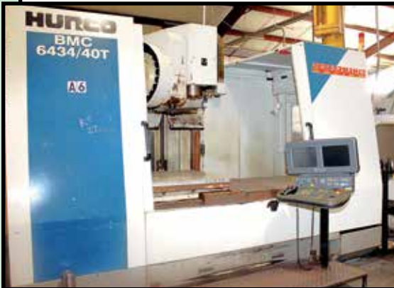
HURCO MDL. BMC6434/40T VERT. MACHINING CENTER