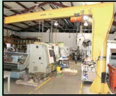
GORBEL 1 T. X APPROX. 18' REACH PEDESTAL JIB CRANE