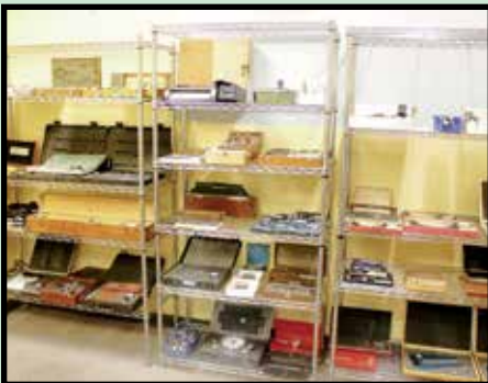
HUGE QUANTITY MEASURING EQUIPMENT