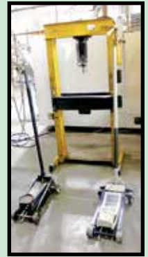
HYDRAULIC SHOP TOOLS