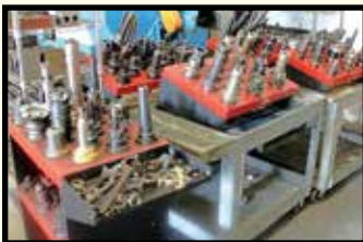
SAMPLE VIEW OF TOOLING