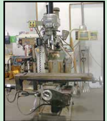
BRIDGEPORT MDL. EZ-TRAK DX PROGRAMMABLE VERT. TURRET MILLING MACHINE