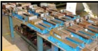
HUGE QUANTITY OF KURT VISES

At the Premises of RT PRECISION MACHINERY, LP 22375 E. Hammond Dr. PORTER (Houston Area), TEXAS 77365 (See Directions on Back Page)