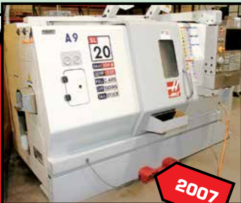
HAAS MDL. SL20T CNC LATHE