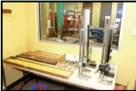
VERNIER CALIPERS AND HEIGHT GAUGES