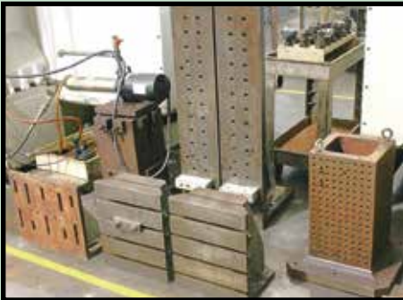
PARTIAL VIEW OF ANGLE PLATES

(100's) CAT-50 AND CAT-40 MACHINING CENTER TOOLHOLDERS, DEVIBE BARS; ENDMILL HOLDERS; SHELL MILL HOLDERS; COLLET STYLE HOLDERS; TAPPING HOLDERS; RIGHT ANGLE HEAD, 3,000 RPM, No. 40 taper, collet nose; WIDE SELECTION OF NUMBER AND LETTER STENCILS in various sizes; 1-2-3 AND 2-3-4 BLOCKS; H.D. BORING BARS; ALORIS QUICK CHANGE TOOLPOST AND HOLDERS in several sizes; LIVE AND DEAD CENTERS; L&W DIVIDING HEAD w/index plates; VARIOUS 3 AND 4-JAW CHUCKS; KURT 6" AND 8" ANGLE LOCK MILLING VISES; YUASA 12" INDEXER; V BLOCKS; GROUND PARALLELS; (15) 2 X 4 X 6 PRECISION GROUND SET-UP BLOCKS; (9) 2 X 3 X 4 PRECISION GROUND SET-UP BLOCKS; (12) 2 X 4 X 10 PRECISION GROUND SET-UP BLOCKS; 10" H.D. MILLING VISE; LARGE QTY. OF HAND AND POWER TOOLS; (2) 8" X 14" TILTING FIXTURE TBLs.; 2 PC. VISE SETS; PLAIN T-SLOTTED BOX TBL.; (2) 8" X 48" X 16" FABRICATED ANGLE PLATES; DRILLED AND TAPPED TOMBSTONE; DEVLIEG 18" X 24" CAST IRON ANGLE PLATE; WELDING SCREENS; POWER AND HAND TOOLS; POLISHING STAND; RYOBI BENCH TOP BANDSAW; BENCH GRINDERS; 2 T. CAP. LEVER TYPE ARBOR PRESS; TILTING VISES; BRIDGEPORT RIGHT ANGLE AND QUILL MASTER ATTACHMENTS; (2) YUASA 8" INDEXERS; THEMAC TOOLPOST GRINDER.