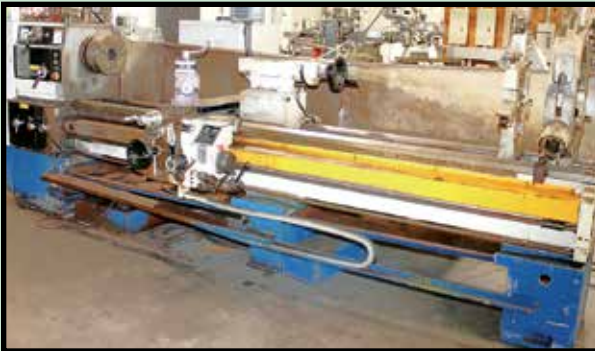
SUMMIT 28" X 120" ENGINE LATHE