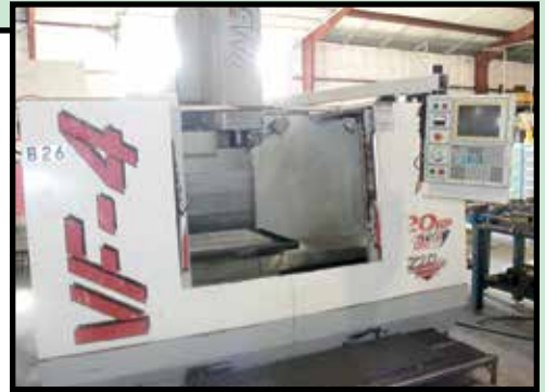
HAAS MDL. VF4 VERT. MACHINING CENTER

HURCO MDL. BMC4020HT/SSM , Ultimax SSM control, 24-pos. ATC, S/N 842SM-91001068CC (Note: this machine is currently out of service.)