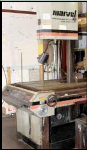
MARVEL SERIES 8 MARK II TILT-FRAME VERT. BANDSAW