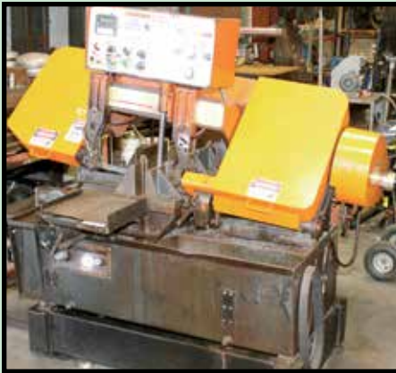
AMADA 10" MDL. HA250 HORIZ. BANDSAW