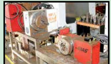
VIEW OF CNC ROTARY TABLES

At the Premises of RT PRECISION MACHINERY, LP 22375 E. Hammond Dr. PORTER (Houston Area), TEXAS 77365