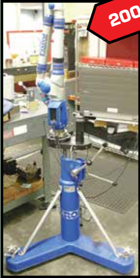
FARO PLATINUM MEASURING ARM