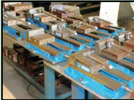
HUGE QUANTITY OF KURT VISES