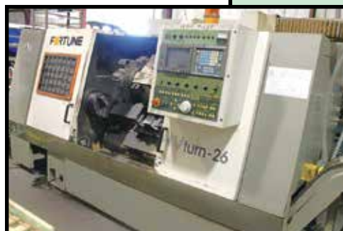
FORTUNE MDL. V TURN-26