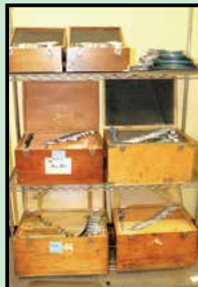
O.D. MICROMETER SETS