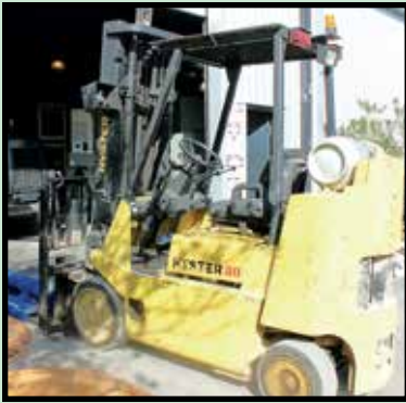
HYSTER 7,650-LB. CAP. MDL. S80XL2BC FORKLIFT