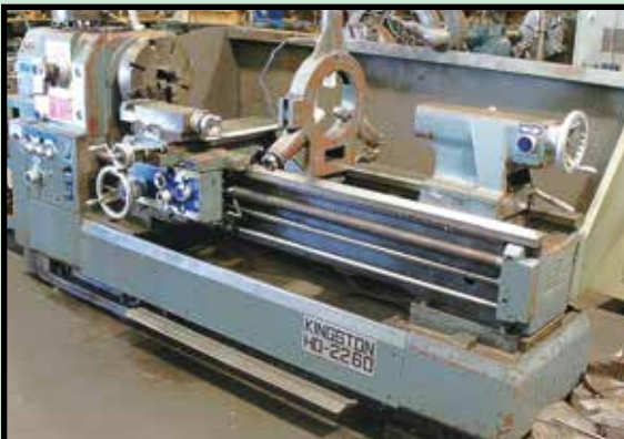
KINGSTON 22" X 60" MDL. HD2260 GAP BED ENGINE LATHE