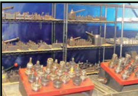
PARTIAL VIEW OF TOOL POST AND TOOL HOLDERS