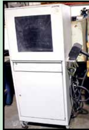
SCHMIDT MDL. STINGER MARKING MACHINE