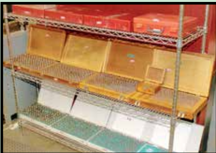
PIN GAUGE SETS