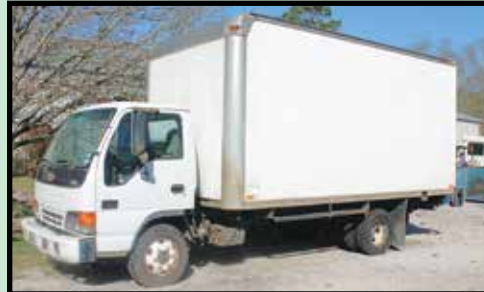
2002 CHEVROLET BOX TRUCK