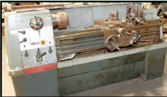
CLAUSING COLCHESTER 15" X 50" ENGINE LATHE