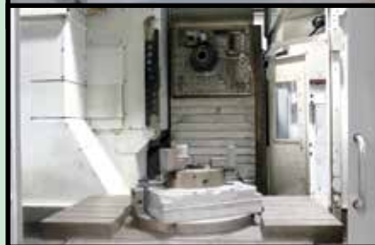
HAAS MDL. EC1600-4X HORIZONTAL MACHINING CENTER