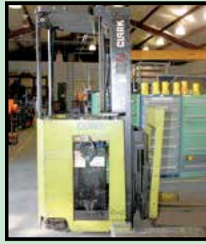
CLARK 2,800-LB. CAP. MDL. NP300D30 ELECTRIC REACH FORKLIFT