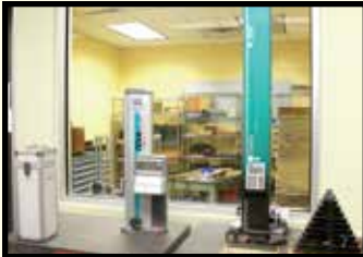
ELECTRONIC HEIGHT GAUGES