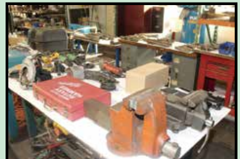
MISCELLANEOUS SHOP SUPPORT EQUIPMENT