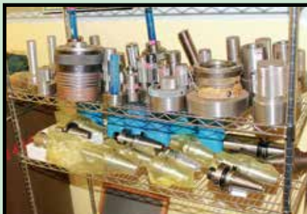
PLUG & RING GAUGE TOOL HOLDERS