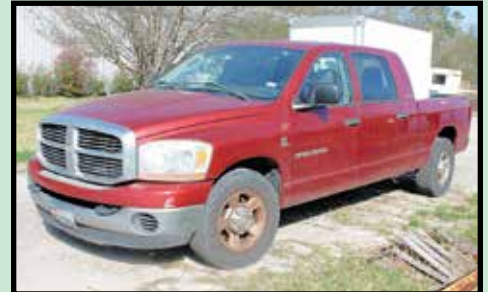
2006 DODGE RAM PICKUP TRUCK