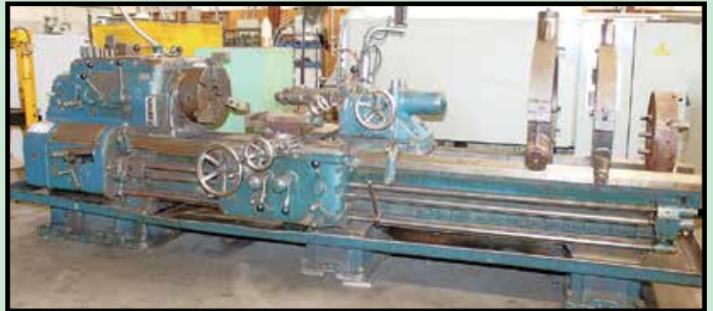
AXELSON 27-1/2" X 96" ENGINE LATHE