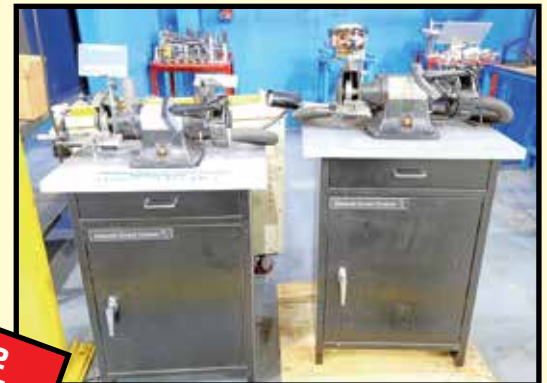
DIAMOND TUNGSTEN TIP GRINDERS