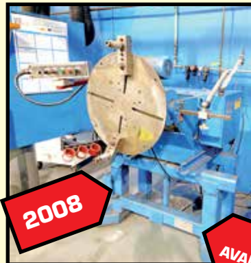
PRESTON EASTIN MDL. PA15HD4 WELDING POSITIONER

MBCR2, 200-lb. cap., variable spd. rotation, manual tilt, S/N RT157.