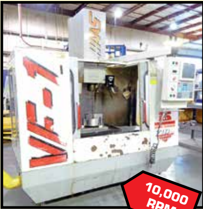
HAAS MDL. VF-1 VERT. MACHINING CENTER