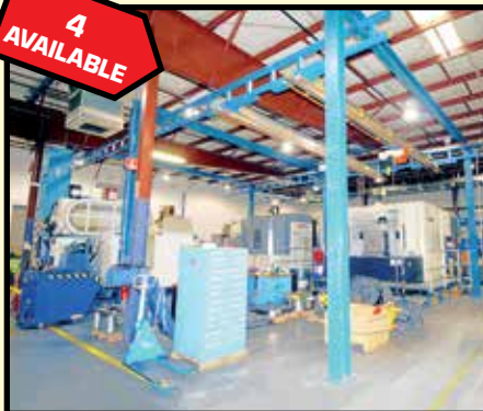
SAMPLE VIEW OF GORBEL LIFT SYSTEMS