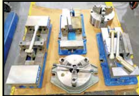
PARTIAL VIEW OF PRECISION MACHINE ACCESSORIES