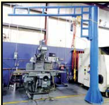
GORBEL 1/4 T. JIB CRANE