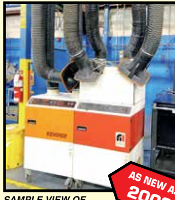
SAMPLE VIEW OF WELD FUME VACUUMS