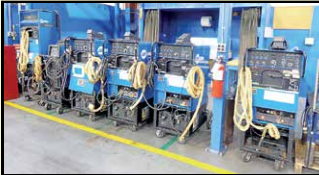
MILLER TIG WELDING MACHINES