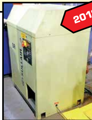
SULLAIR MDL. SR-400 REFRIGERATED AIR DRYER