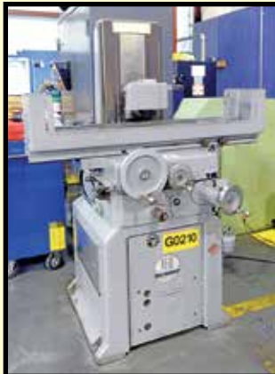
REID HYDRAULIC SURFACE GRINDER