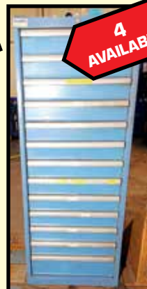
LISTA ROLLER DRAWER TOOL CABINETS