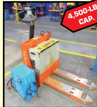
TOYOTA ELECTRIC PALLET JACK