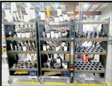
SAMPLE VIEW OF CAT-50 TAPER TOOLING

KEMPER TYPE 8421014, new 2008, (2) articulating collector boom, S/N 203725.