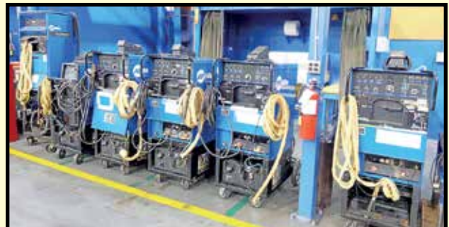
MILLER TIG WELDING MACHINES