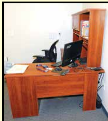
DESKS AND HUTCHES