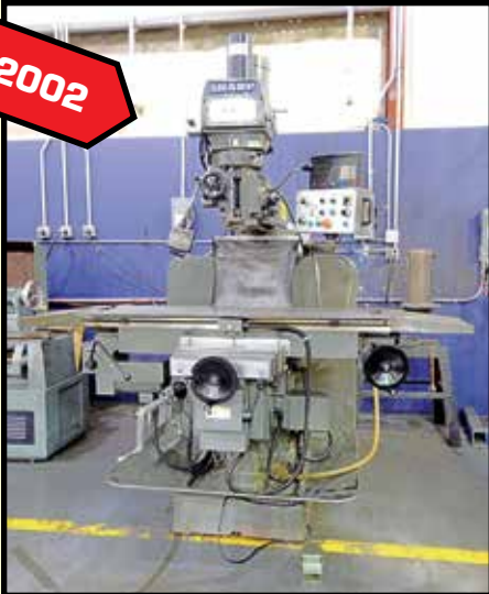
SHARP VERT. TURRET MILLING MACHINE