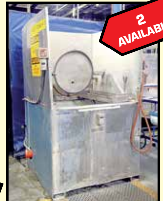
STAINLESS WASH SYSTEM