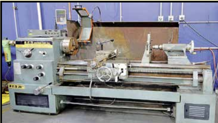
HES 20" X 60" ENGINE LATHE