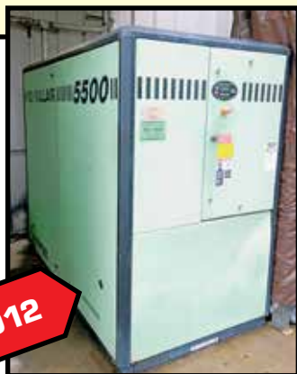
SULLAIR 5500 VARIABLE SPEED ROTARY SCREW AIR COMPRESSOR

ECOA 6,500-LB. CAP. MDL. H2 ELECTRIC SCISSOR LIFTS on roller bed, S/N 130117; G.S. 500-LB. CAP. ROLLER SCISSOR LIFT w/foot pump; GLOBAL 800-LB. CAP. PALLET STYLE HYDRAULIC BARREL LIFTER ; ASSORTED ADJUSTABLE HT. PALLET RACK ; ASSORTED MANUAL HYDRAULIC PALLET JACKS .