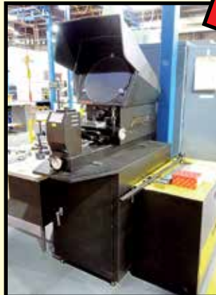
MASTER VIEW OPTICAL COMPARATOR