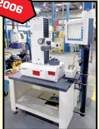
ZOLLER TOOL PRESETTER