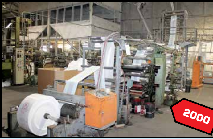
(1 OF 2) ELITE PLASTIC MACHINERY DOUBLE EXTRUSION LINES