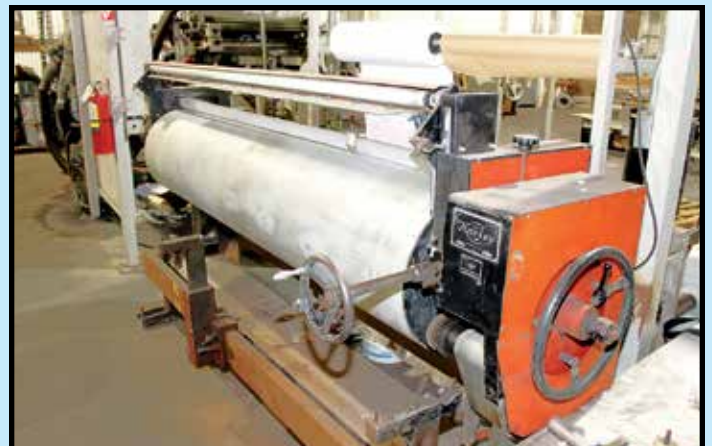
E.L. HARLEY INC. PLATE MOUNTER