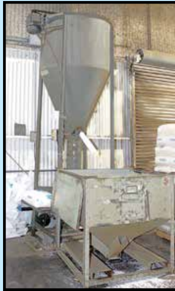
ILIE MACHINE 500 KGS CAP. RAW MATERIAL MIXER