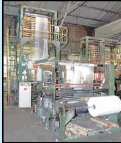
ILIE MACHINERY MDL. FPLA-55MM EXTRUDER/FILM LINE