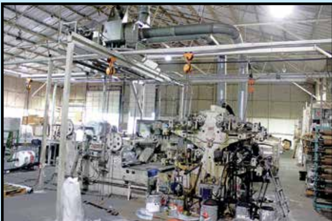
FAUSTEL 4-COLOR MDL. E41-II CI FLEXOGRAPHIC PRINTING PRESS

BUYER'S PREMIUM: 15% ON-SITE 18% WEBCAST