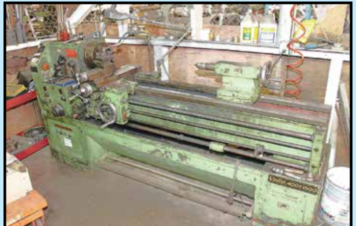
VICTOR 14 X 60 ENGINE LATHE