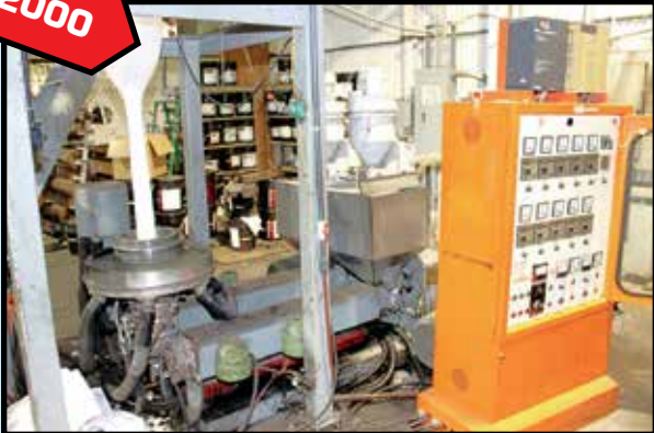
CLOSE-UP OF SUH FONG MDL. 45X45 EXTRUDER