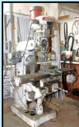
MSC 9" X 48" VERTICAL TURRET MILL