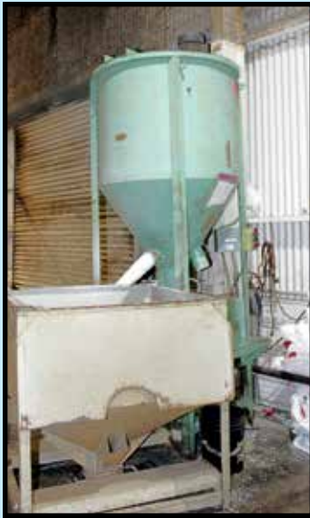
SUH FOUNG 500 KGS CAP. RAW MATERIAL MIXER