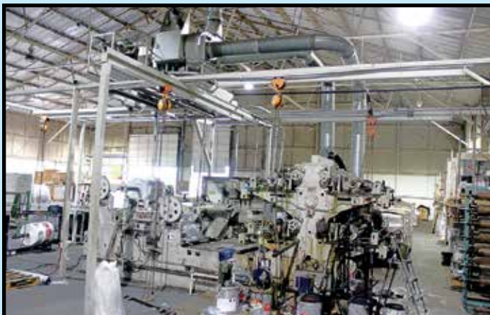
FAUSTEL 4-COLOR MDL. E41-II CI FLEXOGRAPHIC PRINTING PRESS

FOR HON-JIN PRINTERS IN VARIOUS SIZES , w/racks.