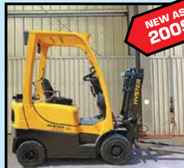
(2) HYSTER 3,000-LB. CAP. FORKLIFTS

On-Site Bidding in Houston, Texas or Bid Via Webcast at