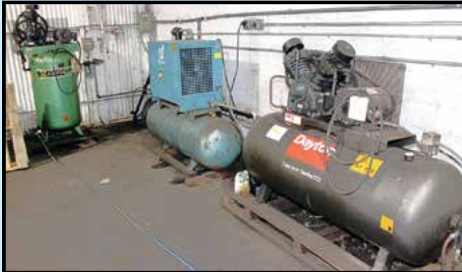
VIEW OF AIR COMPRESSORS

On-Site Bidding in Houston, Texas or Bid Via Webcast at BidSpotter.com