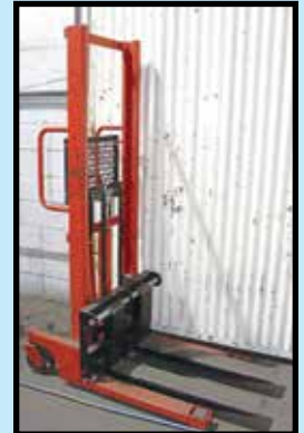
1,000 KG HYDRAULIC WALK-BEHIND PALLET LIFT