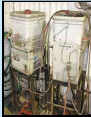
MEISEI CORP. MDL. GP-10-P10 VISCOSITY CONTROLLERS