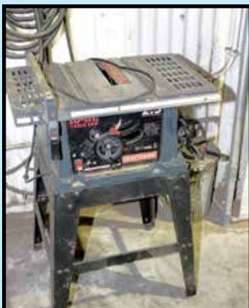
CRAFTSMAN TILTING ARBOR TABLE SAW

(2) MIGHTY LIFT 5,500-LB. CAP. PALLET JACKS ; PALLET JACK ; PITTSBURGH 3 T. CAP. TRUCK JACK ; 1,000 KG. HYDRAULIC WALK-BEHIND PALLET LIFT ; SALTER BRECKNELL 500-LB. CAP. 4X4 DIGITAL PLATFORM SCALE ; PORTABLE PLATFORM SCALE ; 5'W. X 3'L. DOCK PLATE .