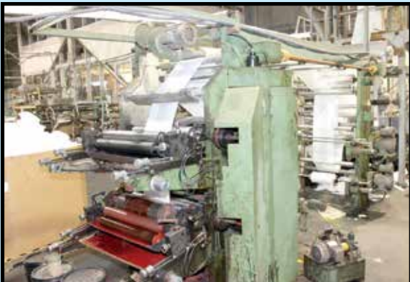
HON-JIN MDL. HJ-4001-600 4-COLOR PRINTING MACHINE