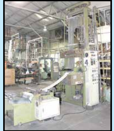
LINE #4 W/KUNG HSING MDL. 45 EXTRUDER/FILM LINE