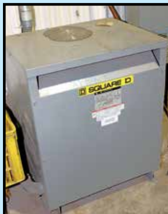
SAMPLE VIEW OF TRANSFORMERS