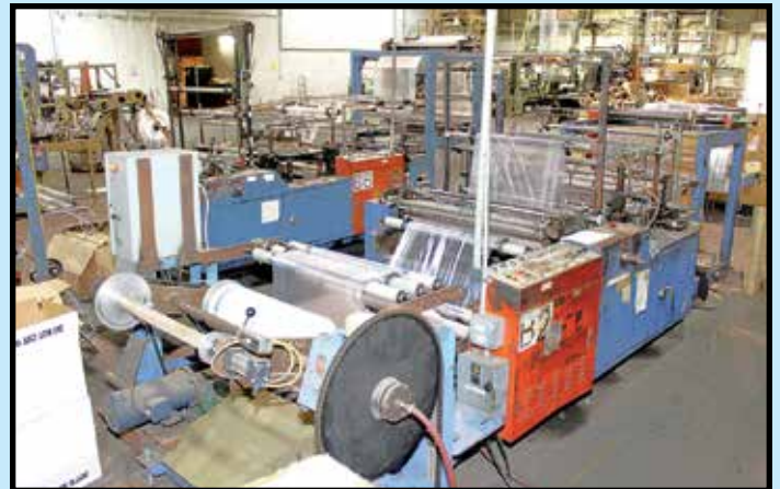
SUNRISE GARMENT BAG MACHINE