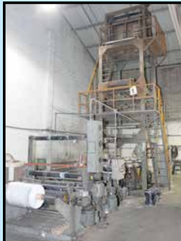
ILIE MACHINERY MDL. EP-LA55 EXTRUDER/FILM LINE