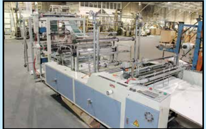
SUNRISE MDL. EKH-32 GARMENT BAG MACHINE