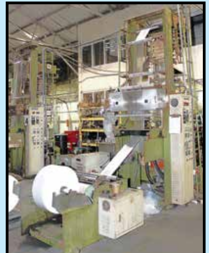
LINE #5 W/KUNG HSING MDL. 45 EXTRUDER