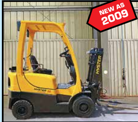
(2) HYSTER 3,000-LB. CAP. FORKLIFTS