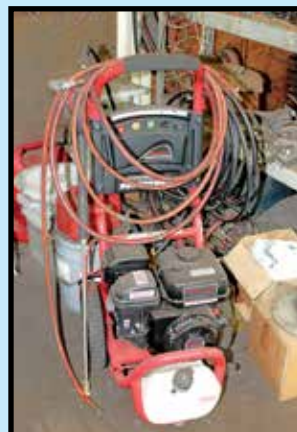
GASOLINE POWERED PRESSURE WASHER