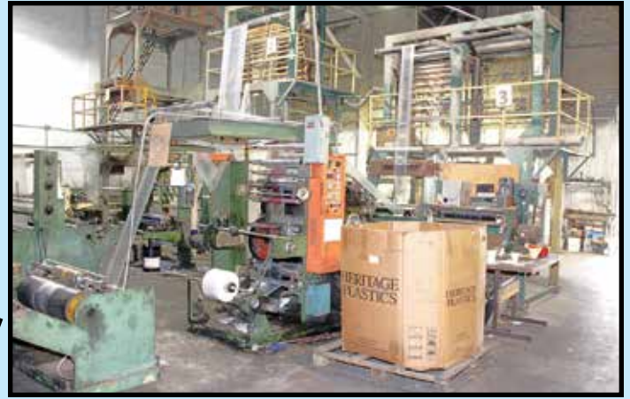
LINE #3 WYLIE MACHINERY MDL. EPDH55 EXTRUDER