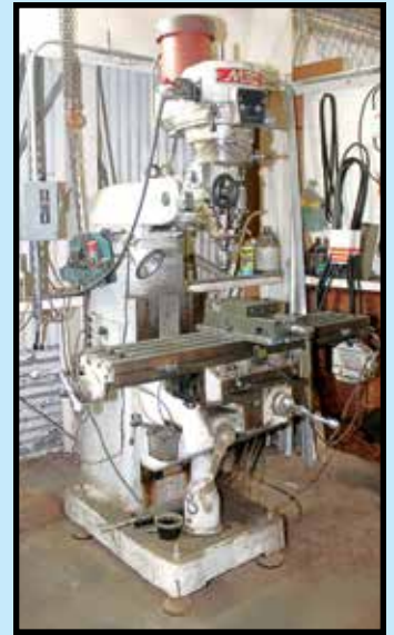
MSC 9" X 48" VERTICAL TURRET MILL