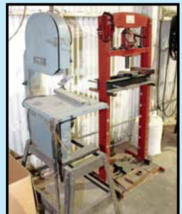
DELTA VERTICAL BANDSAW AND H-FRAME PRESS

ARE YOU SELLING YOUR PLANT? CALL 1-800-282-8466 FOR A CONFIDENTIAL CONSULTATION